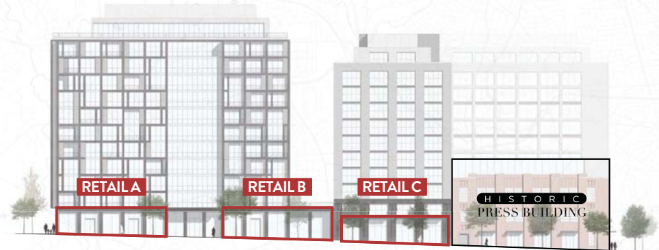
N ST NE