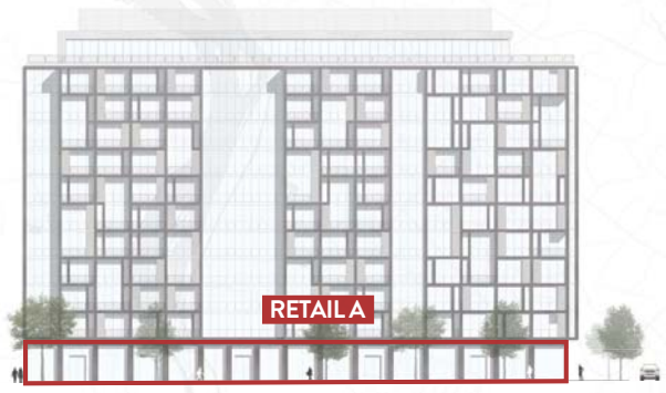
4TH ST NE