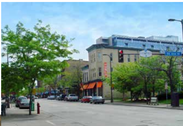
Historic charm and authenticity of Northeast neighborhood