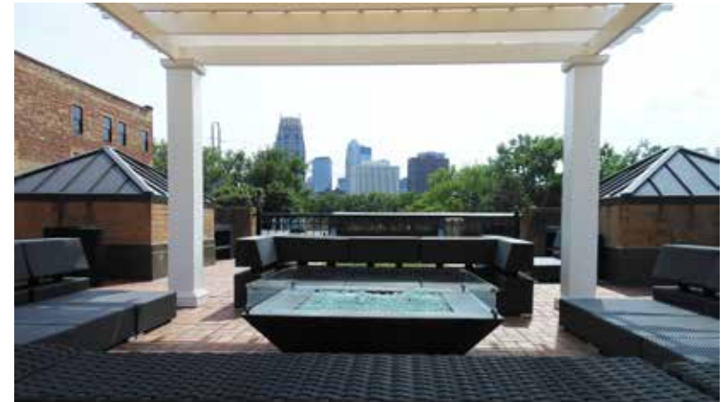
Newly renovated rooftop deck with city views

For additional information and availability: