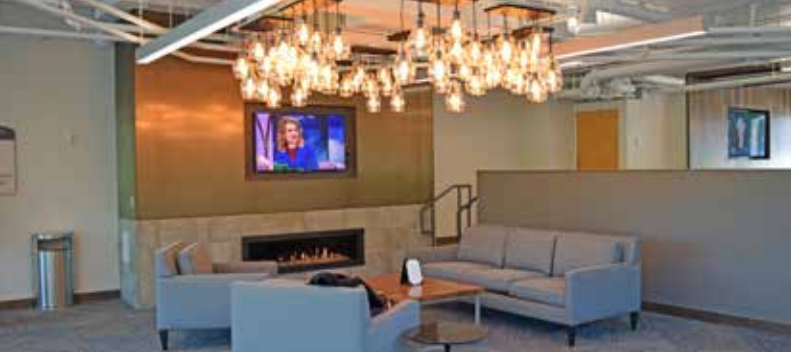
Upgraded tenant lounge with fireplace