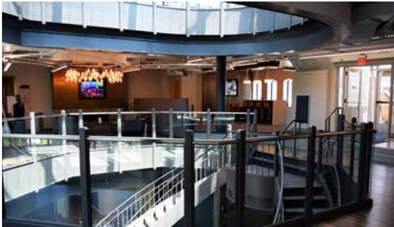
Collaborative work areas with abundant natural light