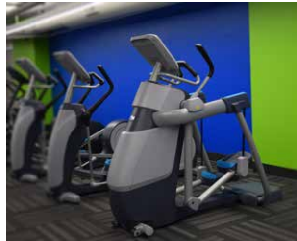
Ellipticals and stationary bicycles