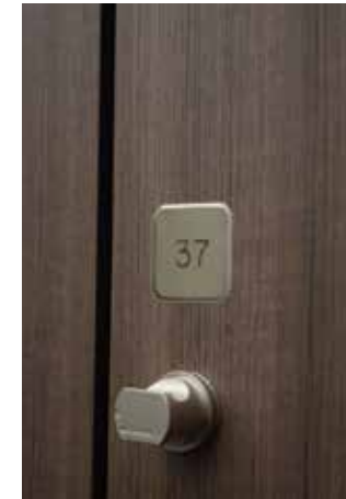
Plenty of lockers in both men's and women's locker rooms