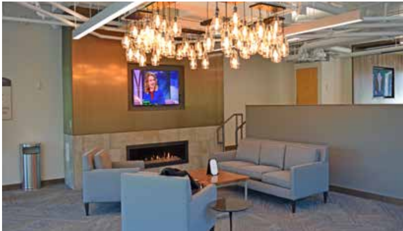
Upgraded tenant lounge with fireplace