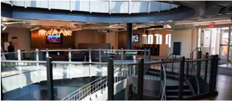
Collaborative work areas with abundant natural light