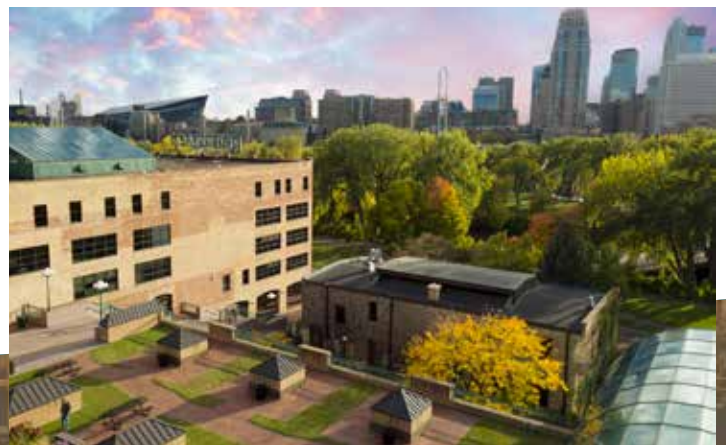
Panoramic views with convenient access to downtown Minneapolis