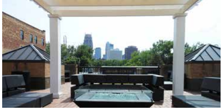
Newly renovated rooftop deck with city views

Significant capital improvements have been designed to enhance Riverplace's sense of community and engage the modern workforce.