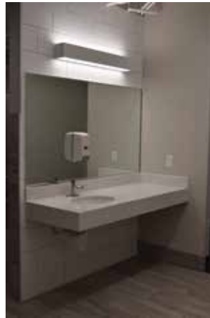
Sink and countertop space for maximum use