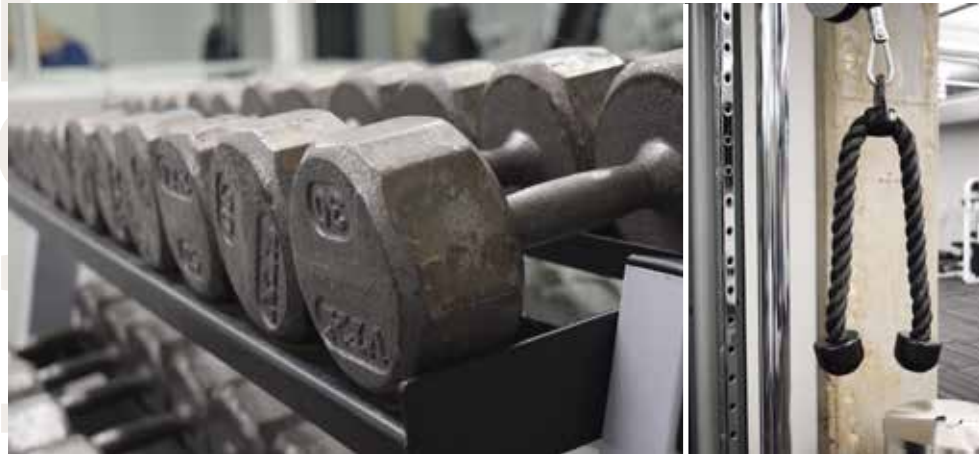
Wide array of weights