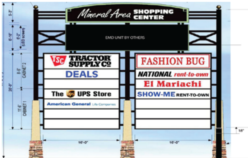
Proposed Pylon Sign

RL Jones Properties 17195 New College Ave. Wildwood, MO 63040 Phone | 636.287.2700 Fax | 636.287.2703 www.rljonesproperties.com