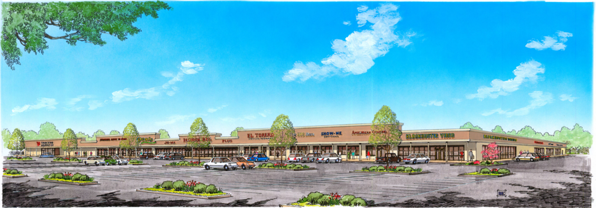
Mineral Area Shopping Center redevelopment facelift