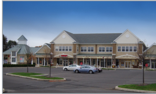
Station Square Shops