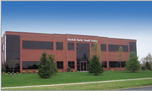
Pennbrook Office Building