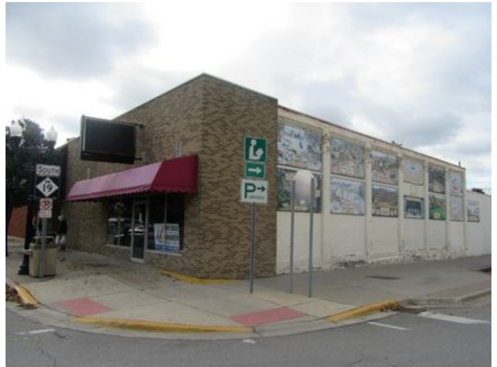
101 S Main_Corner