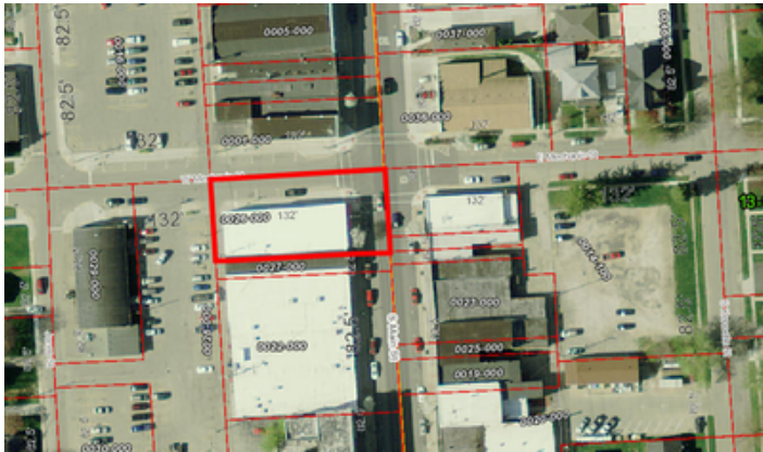
101 S Main Street_Yale_1