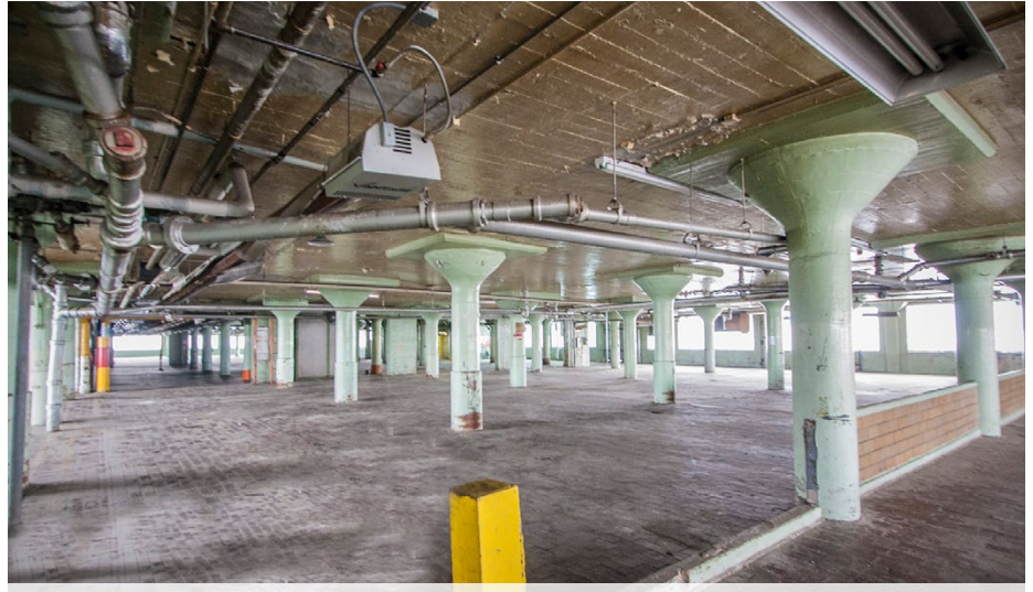
Second Floor Interior