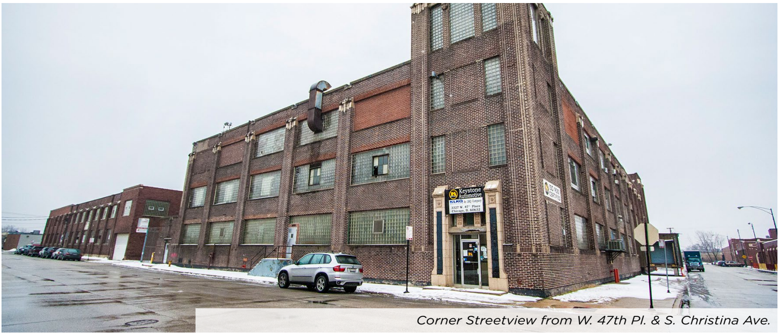
Corner Streetview from W. 47th Pl. & S. Christina Ave.