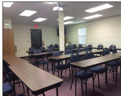
Annex Training Room

DISCLAIMER: Information contained herein is from sources deemed reliable, but not verified and no warranty is made as to the accuracy thereof. This offering is made subject to errors. Omissions, change of price or other conditions, prior sale or lease or withdrawal without notice. Prospective buyers/ tenants are encouraged to verify, independently, all pertinent data. The Mahoney Group, Inc. 3825 S. Florida Avenue, Suite 5, Lakeland, Florida 33813 is the agent of and represents the Owner/Landlord of this property.