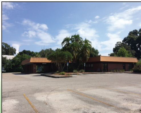
Parking Lot View