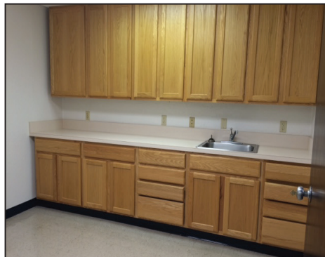
Conference / Breakroom