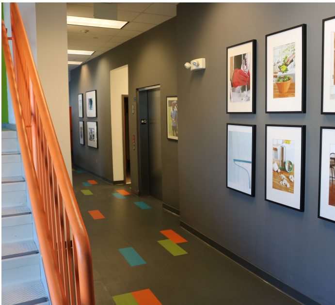
1st Floor Office