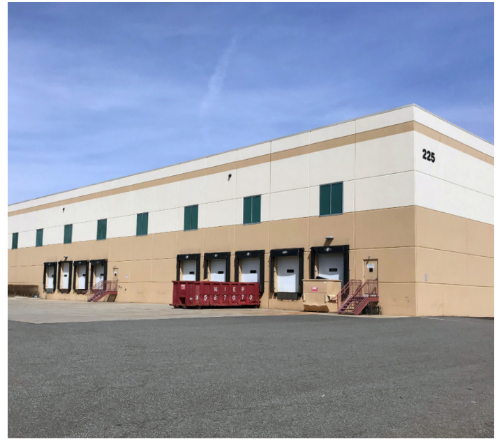
Loading (Expandable to 20 Dock Doors)