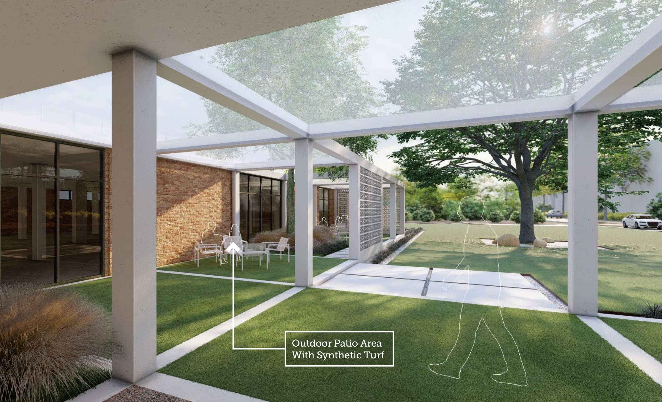
Outdoor Patio Area With Synthetic Turf