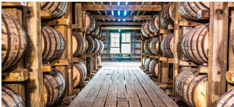
The start and Northern home of the Kentucky Bourbon Trail.