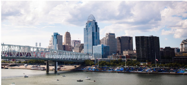
Iconic views of the Cincinnati Skyline with access to downtown amenities including US Bank Arena, Great American Ball Park, Paul Brown Stadium, The Banks and Smale Park.

A place where you'll be proud to welcome clients, employees, and every guest. Above all else, your guests are our guests. Built for activity and interaction, office space at Newport on the Levee breeds community. Inspire workflow with a power hour along the Riverwalk; bond as a team at one of our lunch spots; dig in over coffee. Wherever and however you work best, Newport on the Levee will make it happen.