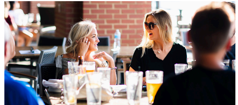
There are over four million annual visitors to Newport on the Levee each year. With over $1B in planned investment in the City of Newport since 2015, the numbers continue to grow.