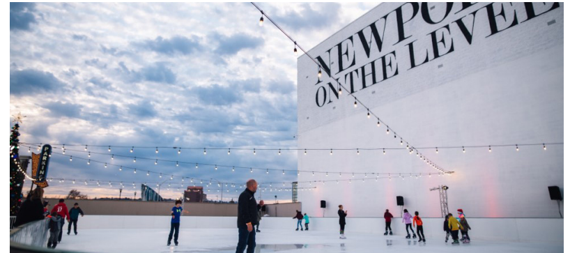
Social epicenter of Northern Kentucky with year-round guest and tenant events and programs including Summer Music, Riverfest and Light Up the Levee.