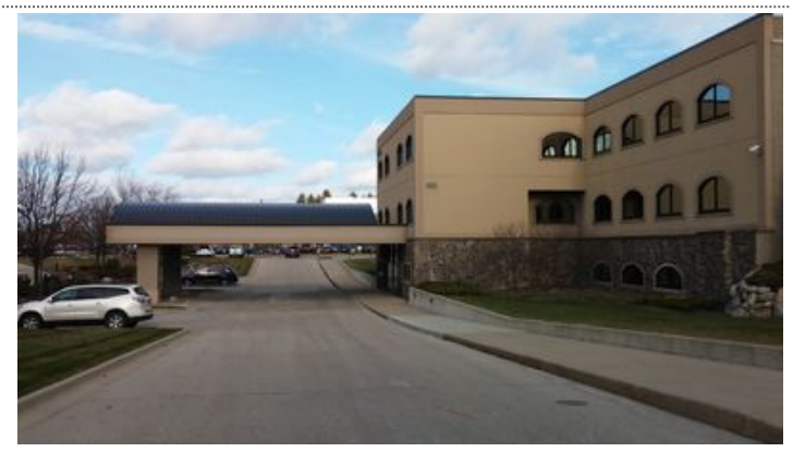
Canopy at Main Entrance