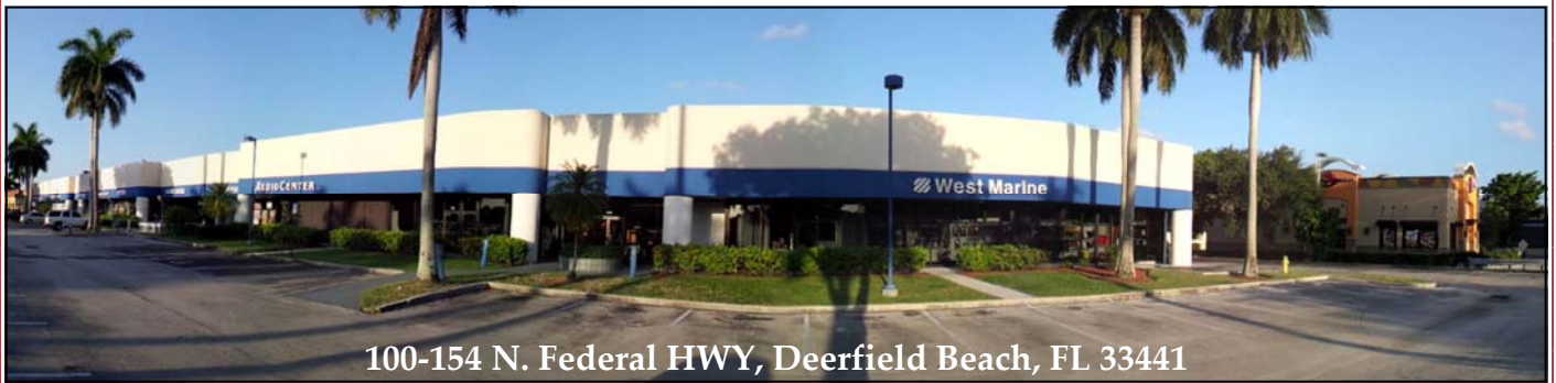
100-154 N. Federal HWY, Deerfield Beach, FL 33441