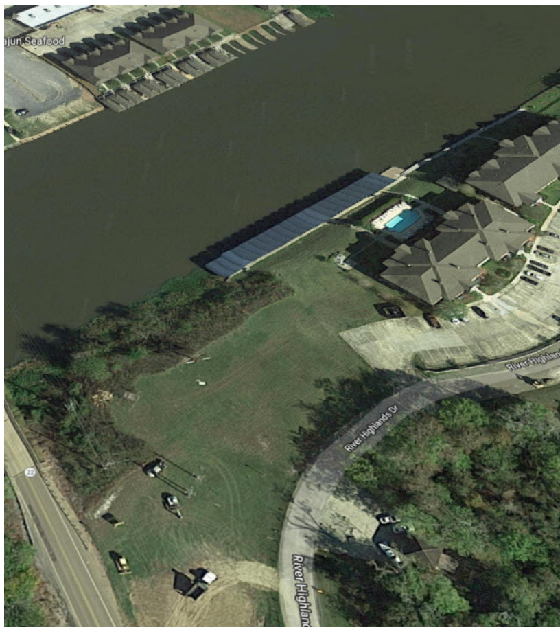
Aerial View of Tract