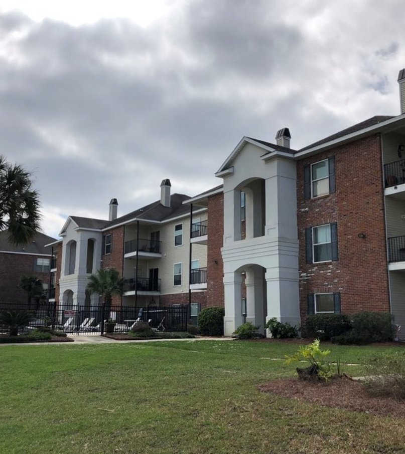
River Highlands Condominiums