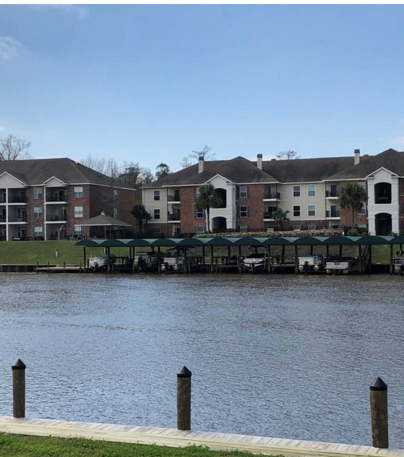
View of River Highlands Condominiums From Other Side of River