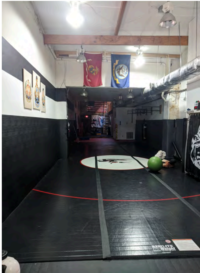
1,900 SF (First Floor)