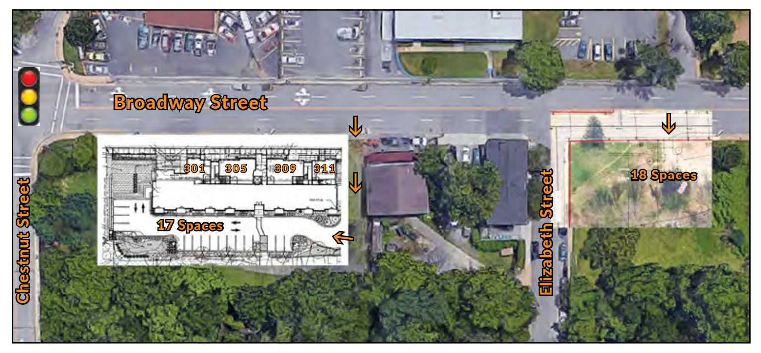
Aerial showing parking plan of 35 non-exclusive spaces: 17 behind 257 Broadway, and 18 spaces at corner of Broadway and Elizabeth