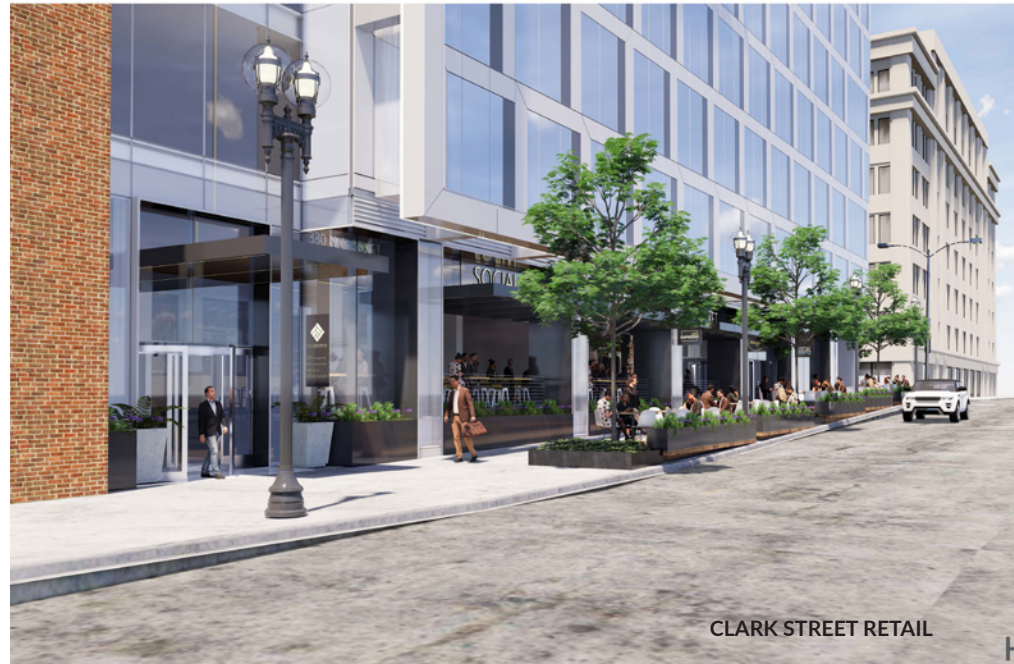
CLARK STREET RETAIL