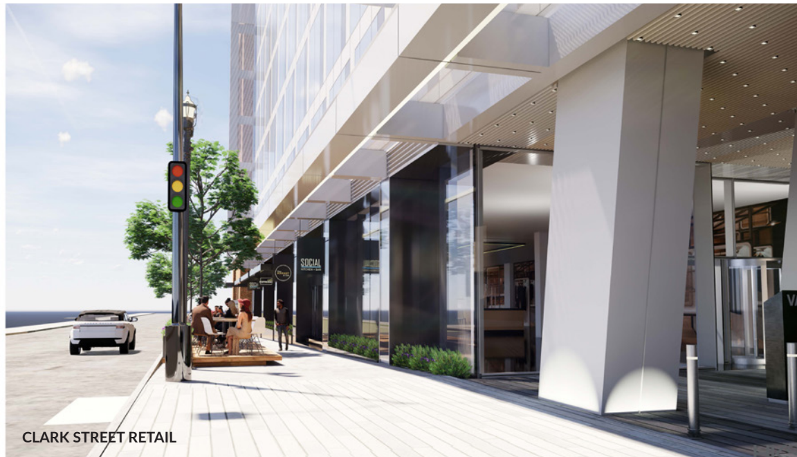
CLARK STREET RETAIL