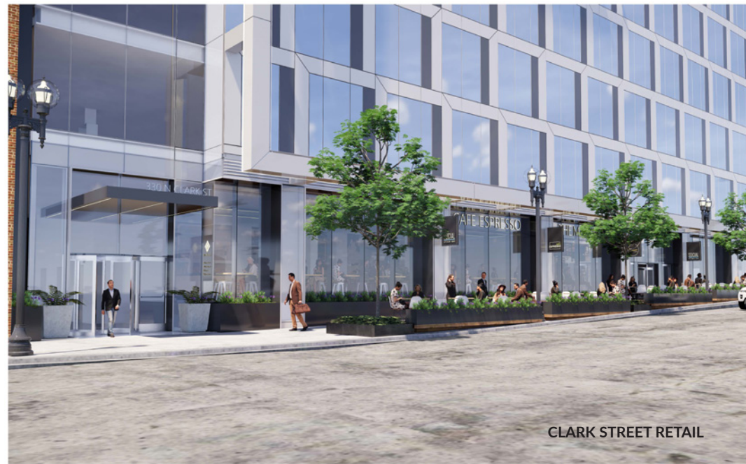
CLARK STREET RETAIL