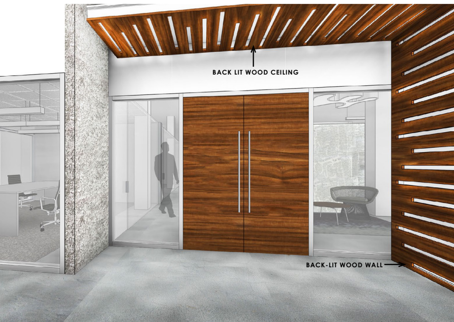
HYPOTHETICAL RENDERINGS OF LOBBY