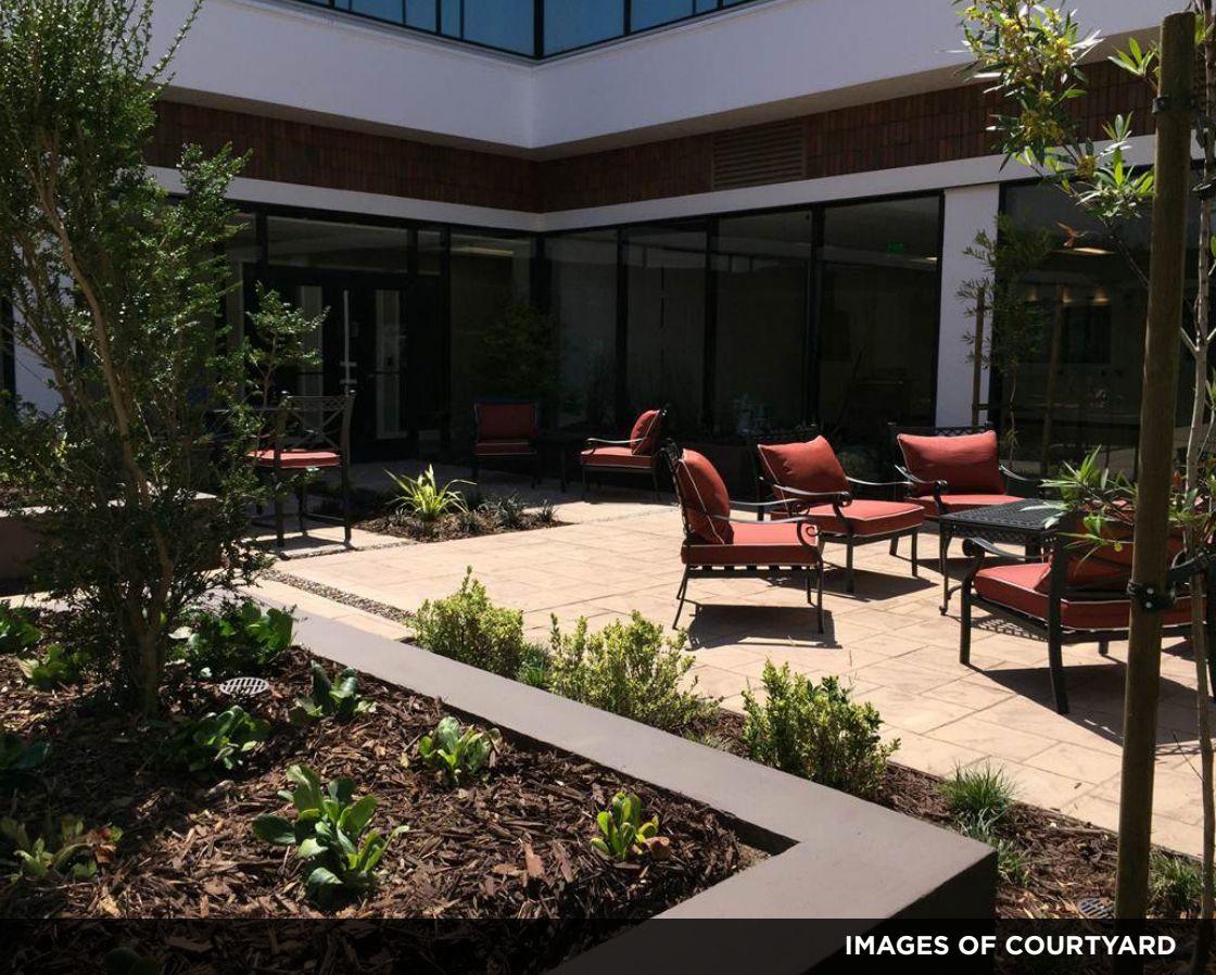
IMAGES OF COURTYARD