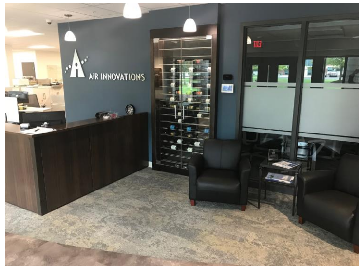
Shared reception area