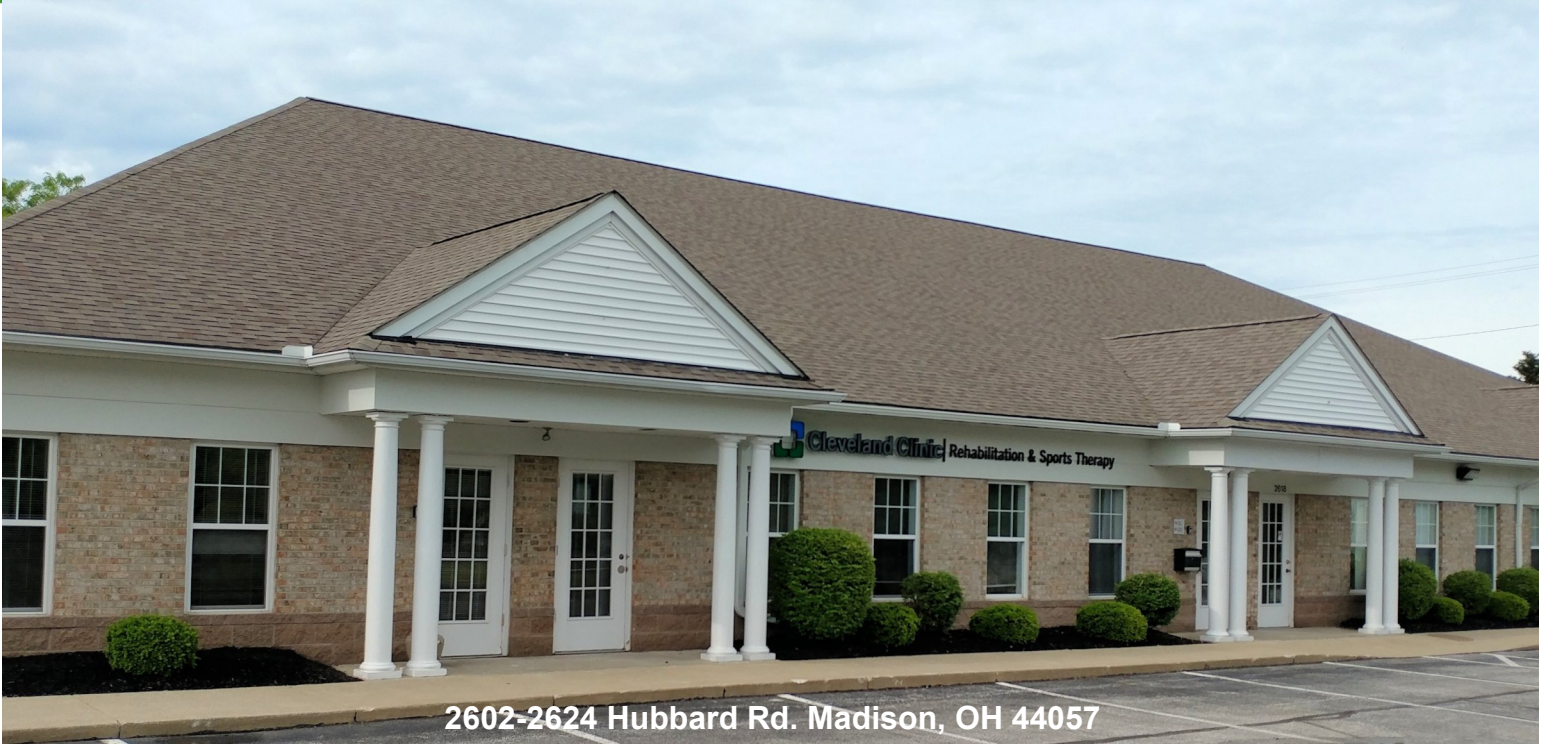
2602-2624 Hubbard Rd. Madison, OH 44057