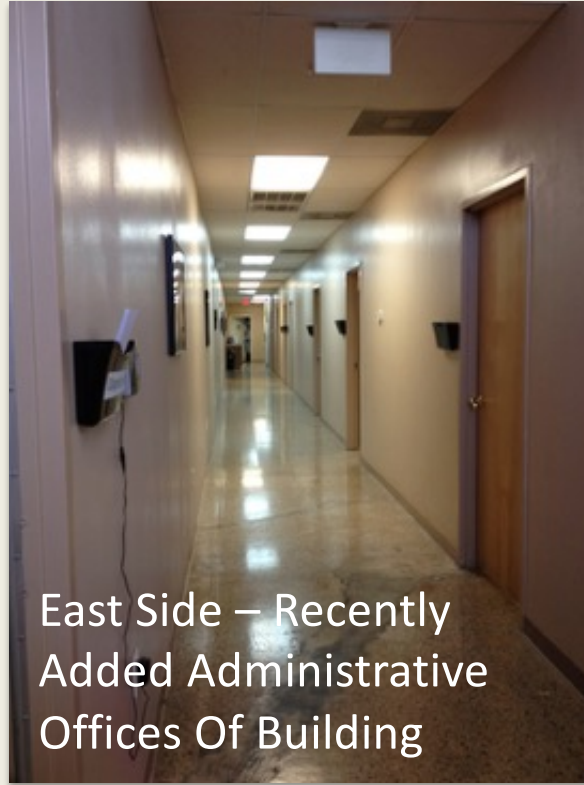
East Side – Recently Added Administrative Offices Of Building