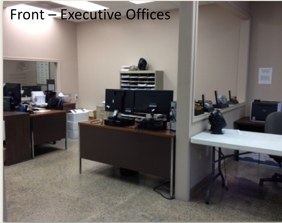
Front – Executive Offices