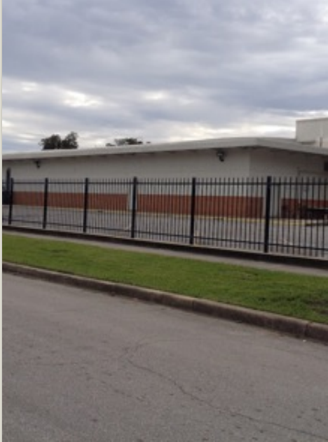
East Side Of Building