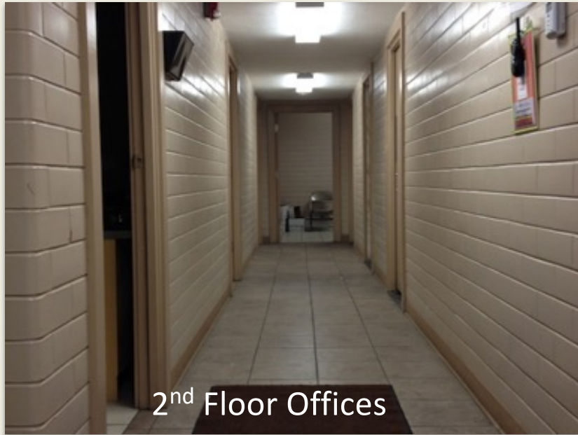
2 nd Floor Offices