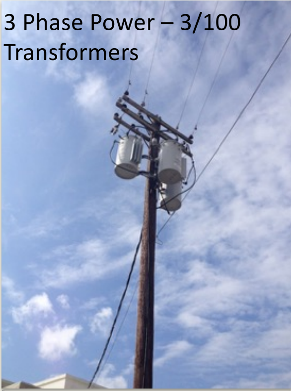
3 Phase Power – 3/100 Transformers