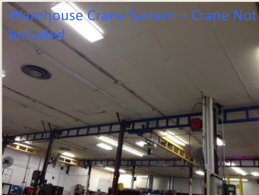
Warehouse Crane System – Crane Not Included