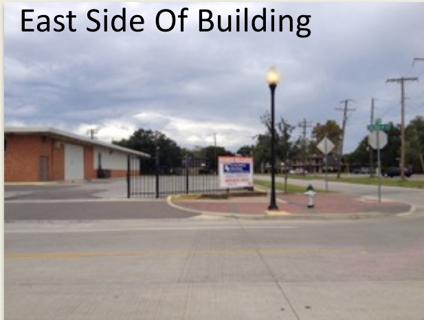
East Side Of Building