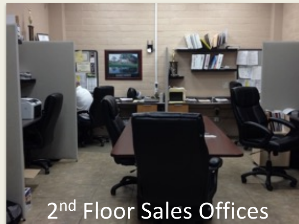
2 nd Floor Sales Offices