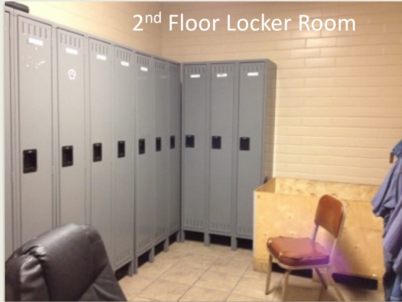
2 nd Floor Locker Room