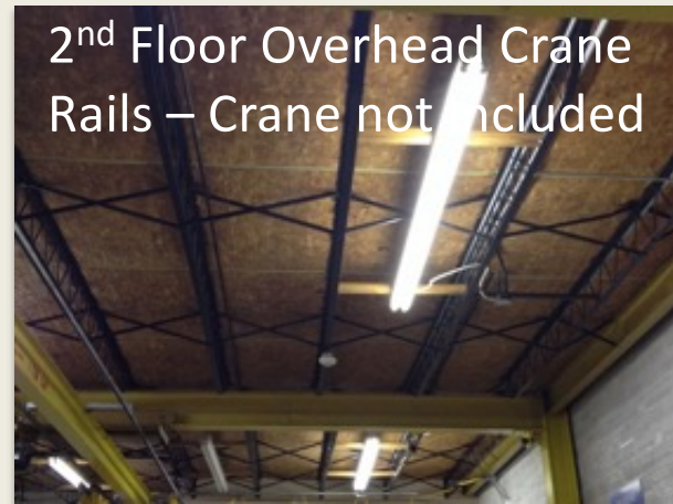
2 nd Floor Overhead Crane Rails – Crane not included