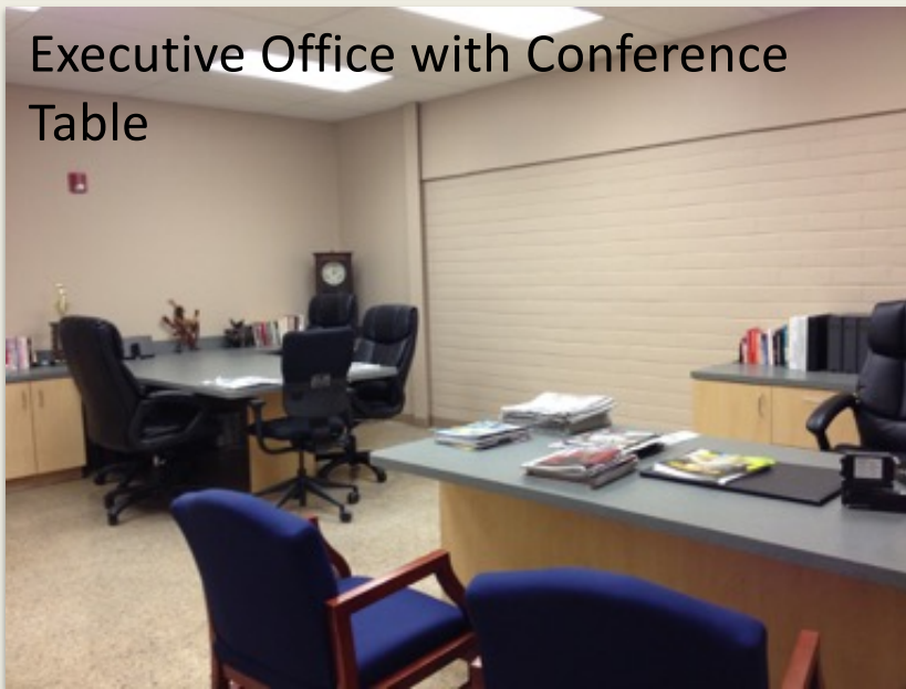
Executive Office with Conference Table