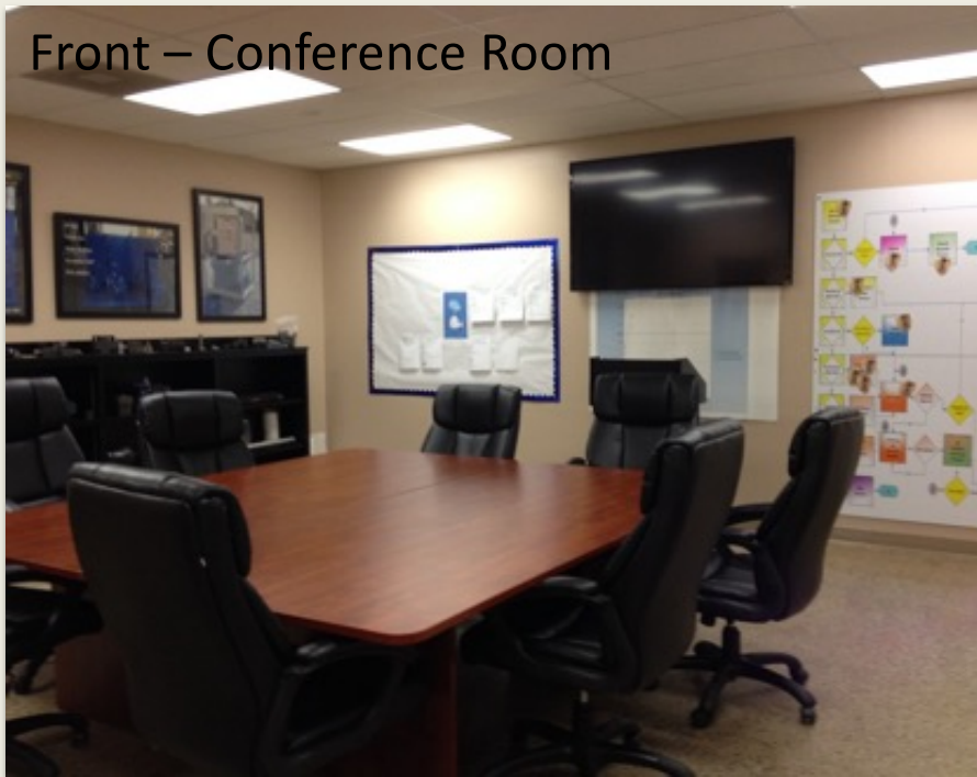
Front – Conference Room