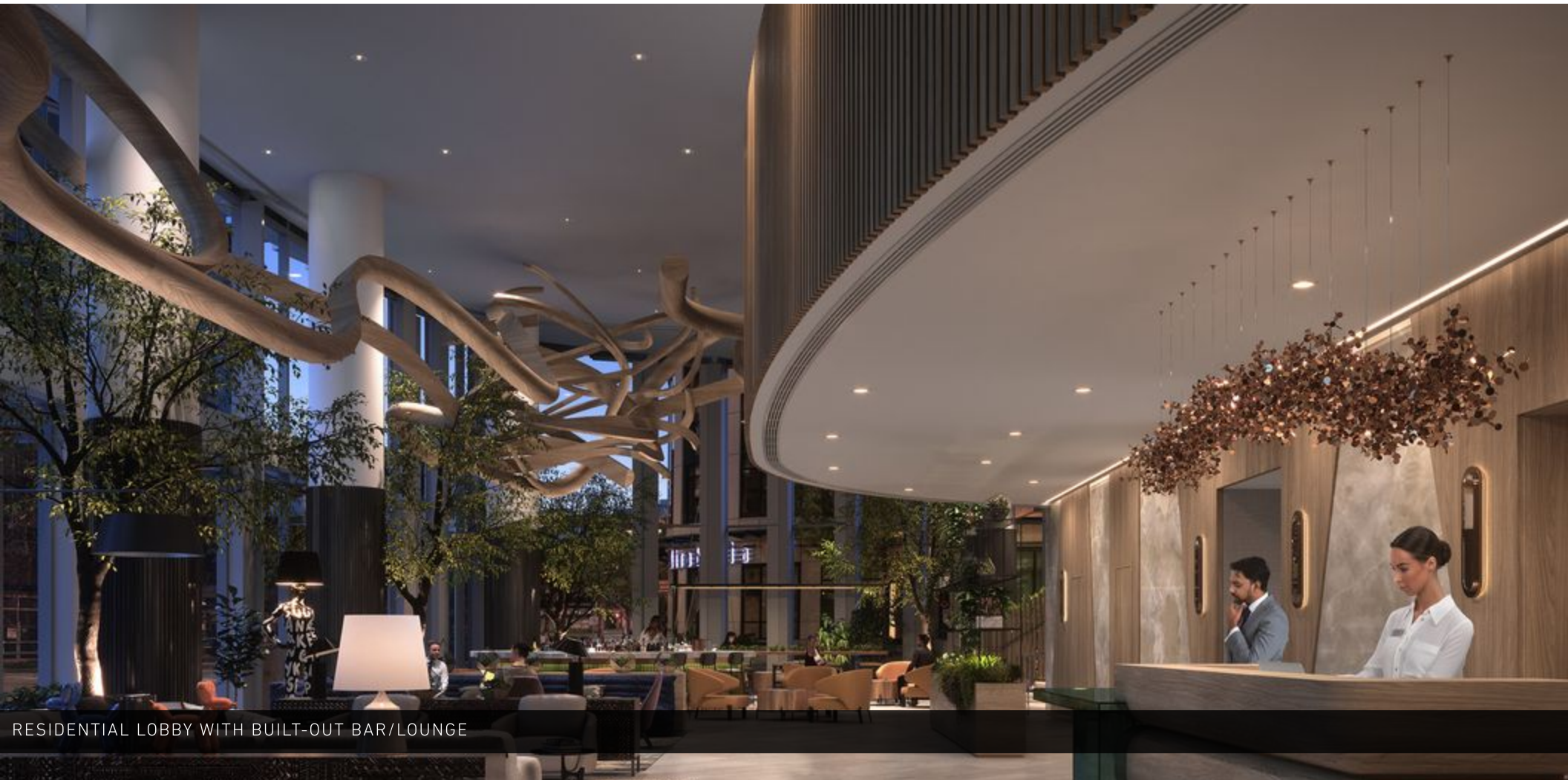
RESIDENTIAL LOBBY WITH BUILT-OUT BAR/LOUNGE