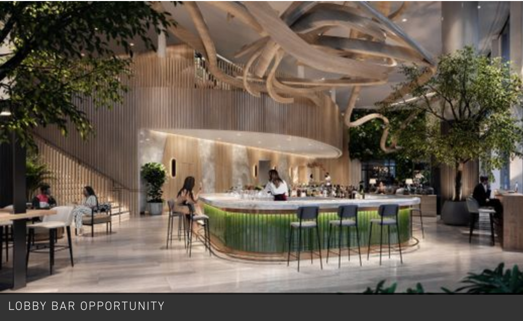
LOBBY BAR OPPORTUNITY