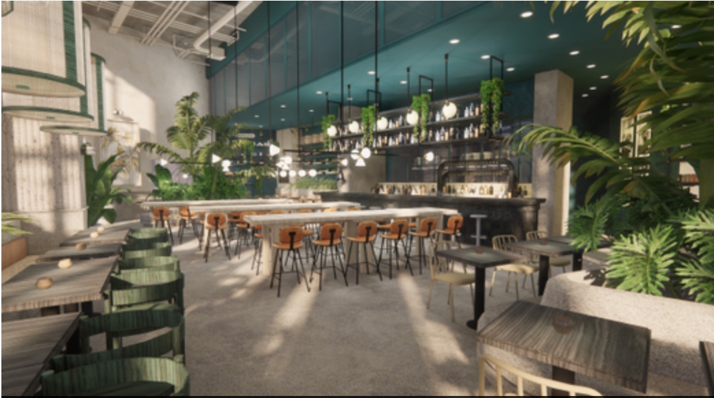
SAMPLE RESTAURANT DESIGN