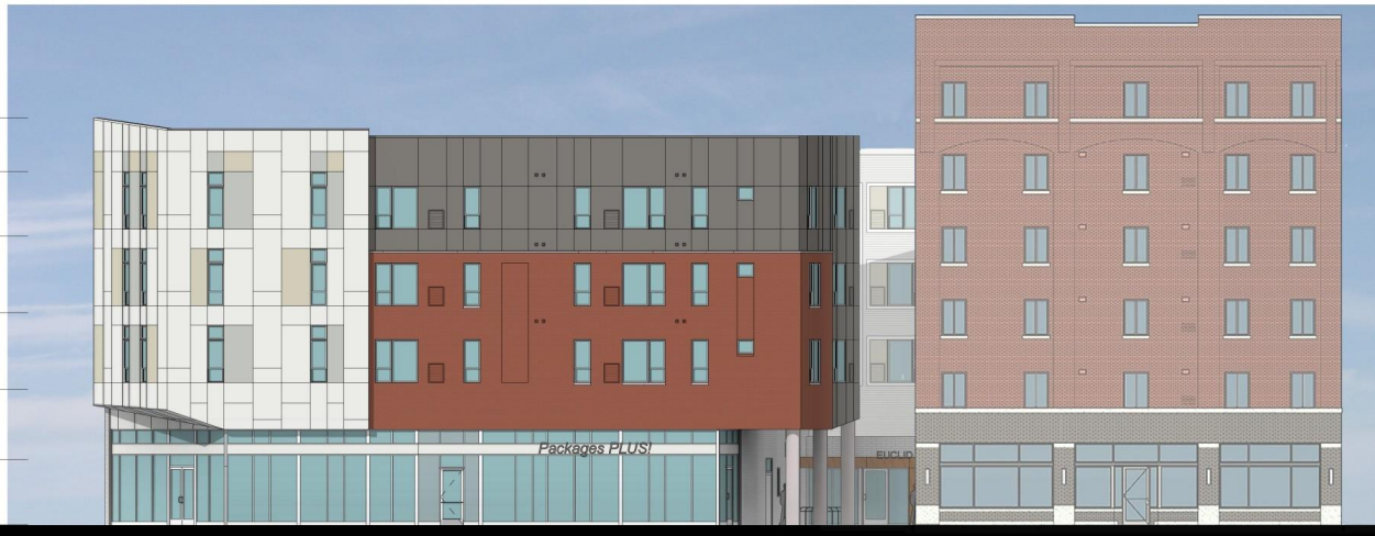
SOUTH ELEVATION - EUCLID AVENUE