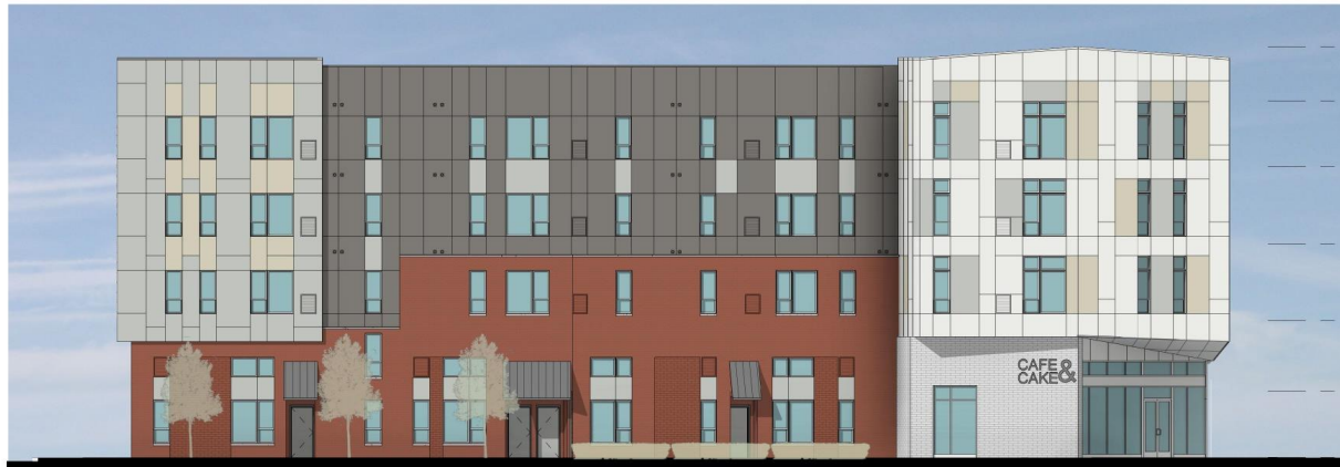
WEST ELEVATION - 115TH ST.