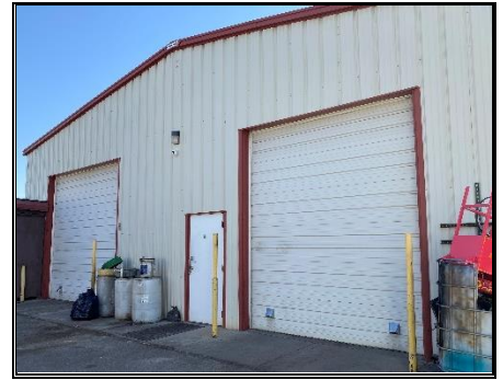
BACK OVERHEAD DOORS