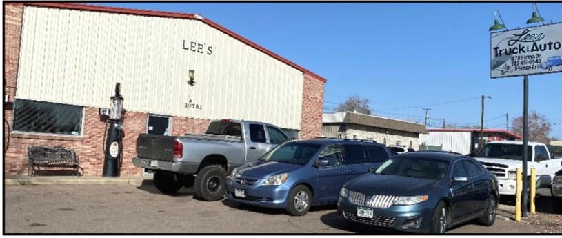
BUILDING FRONT & SIGNAGE