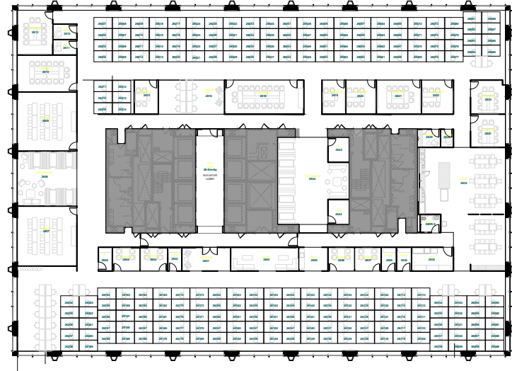
26th Floor – 26,517 SF, 240 workstations Conf. Rooms - 16, Phone Rooms - 7