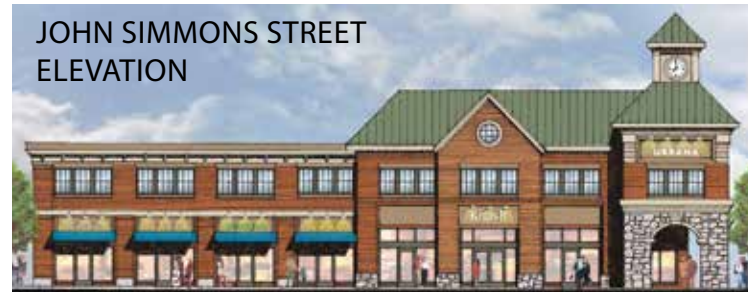
JOHN SIMMONS STREET ELEVATION