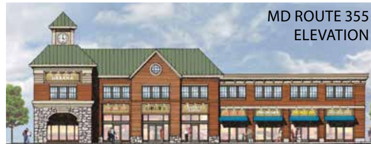
MD ROUTE 355 ELEVATION