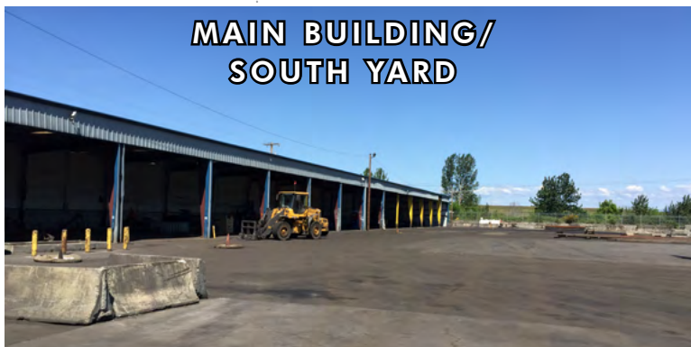
MAIN BUILDING/ SOUTH YARD