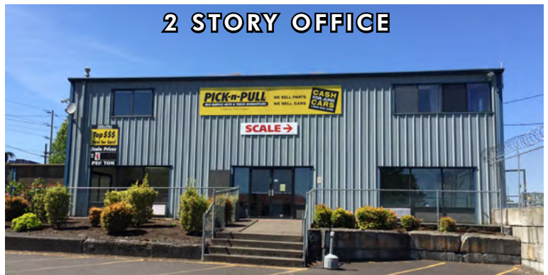
2 STORY OFFICE