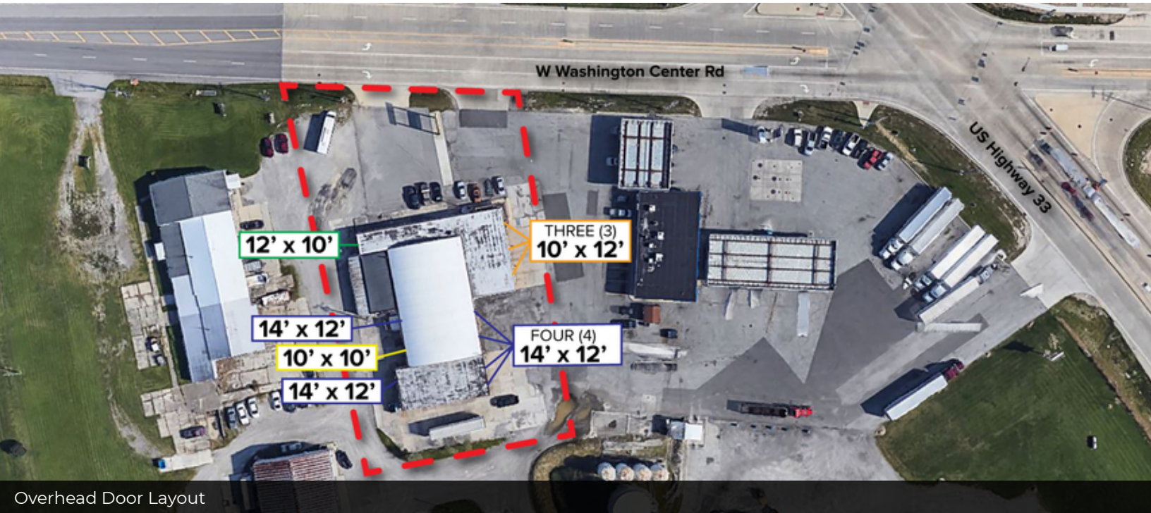
Overhead Door Layout