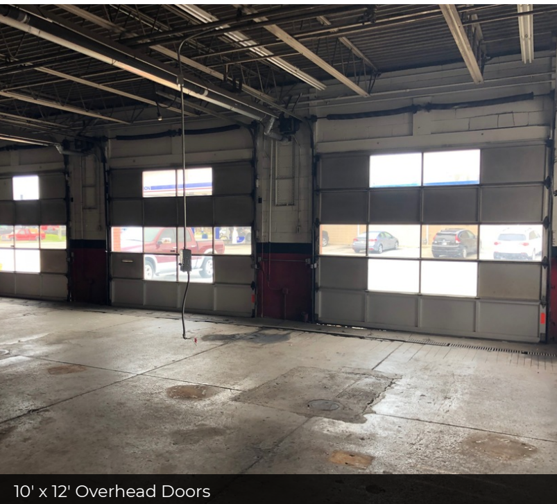
10' x 12' Overhead Doors