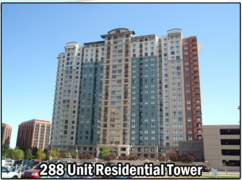
288 Unit Residential Tower