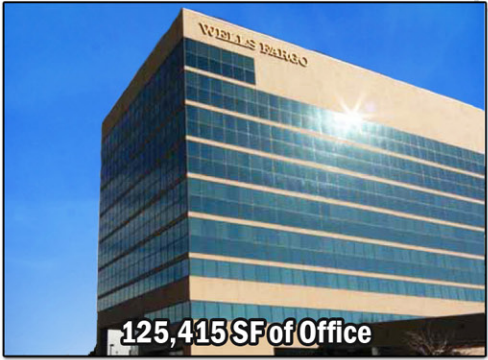
125,415 SF of Office

STAY • PLAY • SHOP • DINE... SEC COLORADO BLVD & CHERRY CREEK DR SOUTH, GLENDALE