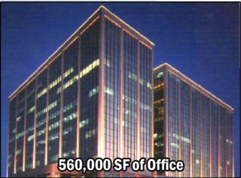
560,000 SF of Office