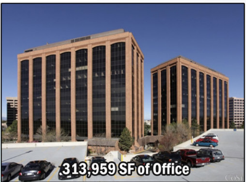
313,959 SF of Office