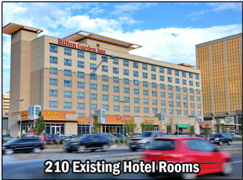
210 Existing Hotel Rooms