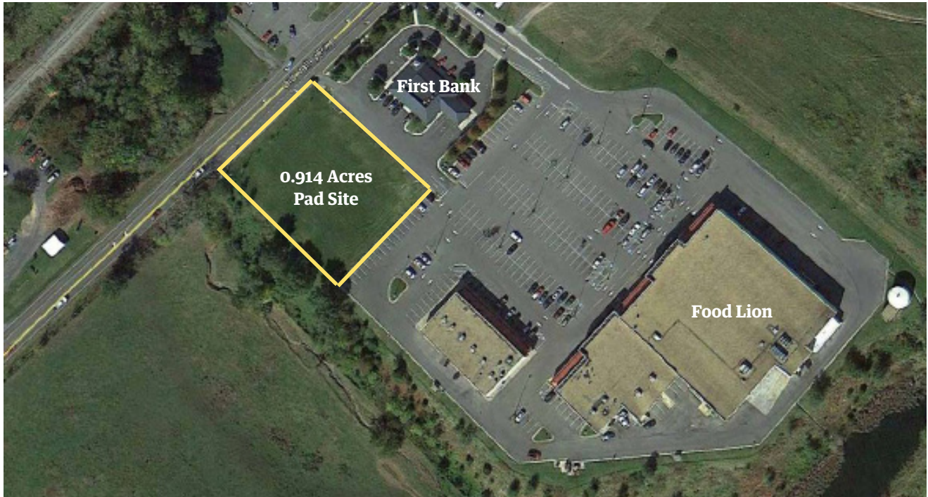
0.914 Acre Pad Site Available