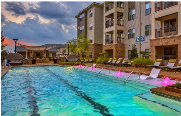
Charlotte Premium Outlets