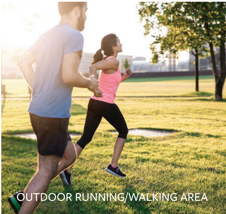
OUTDOOR RUNNING/WALKING AREA