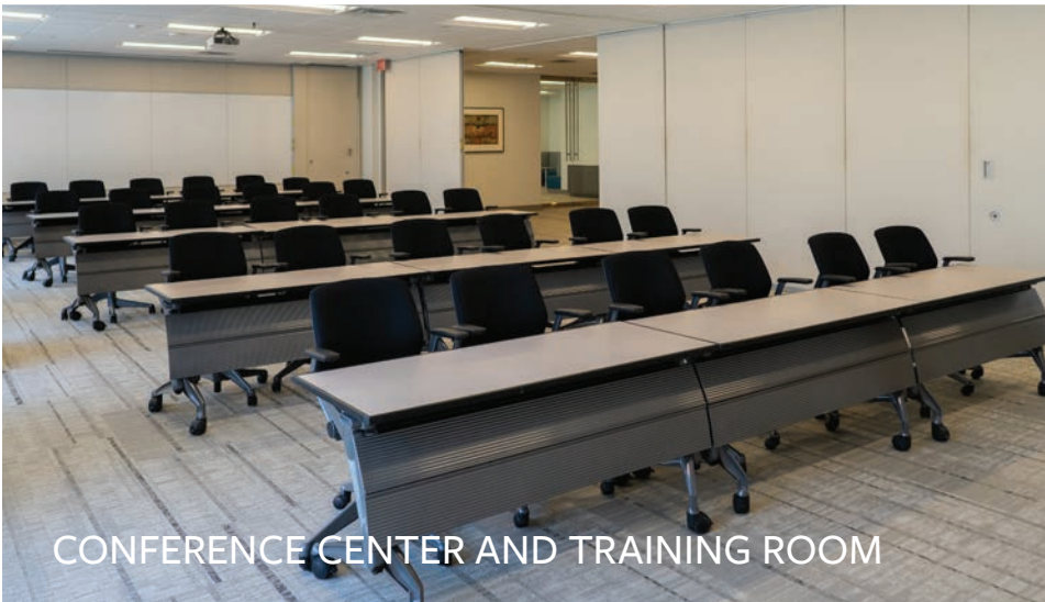
CONFERENCE CENTER AND TRAINING ROOM