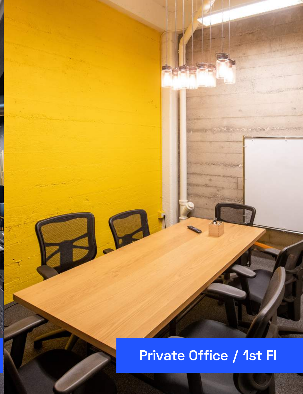
Private Office / 1st Fl