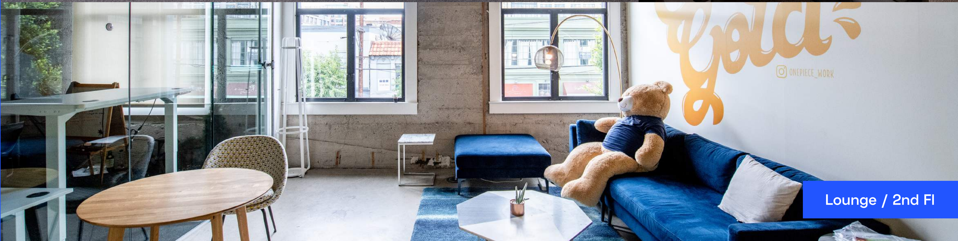
Lounge / 2nd Fl