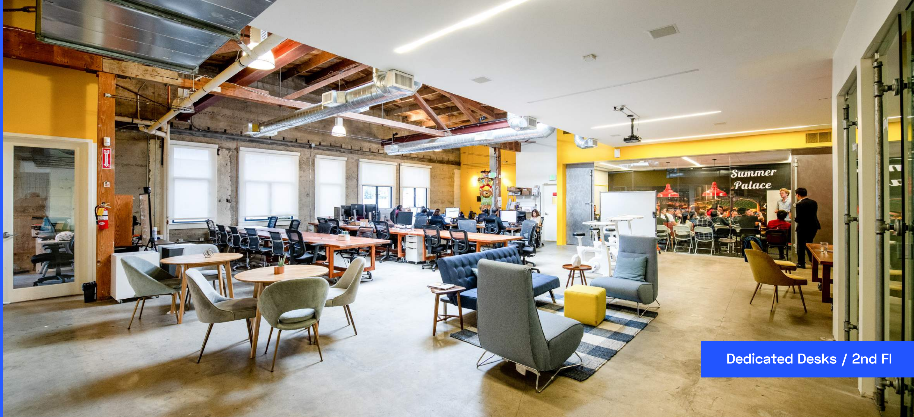
Dedicated Desks / 2nd Fl