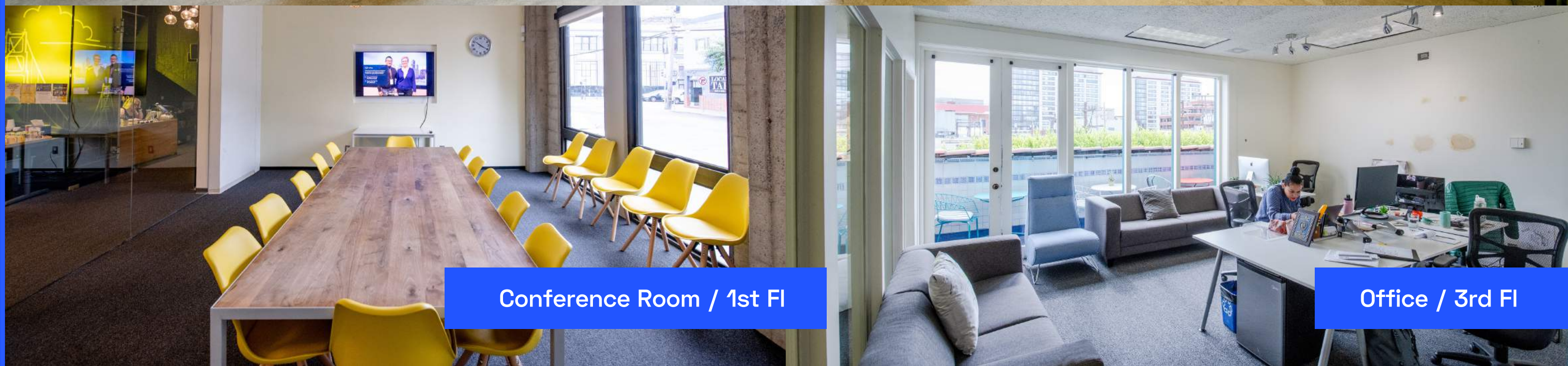
Conference Room / 1st Fl