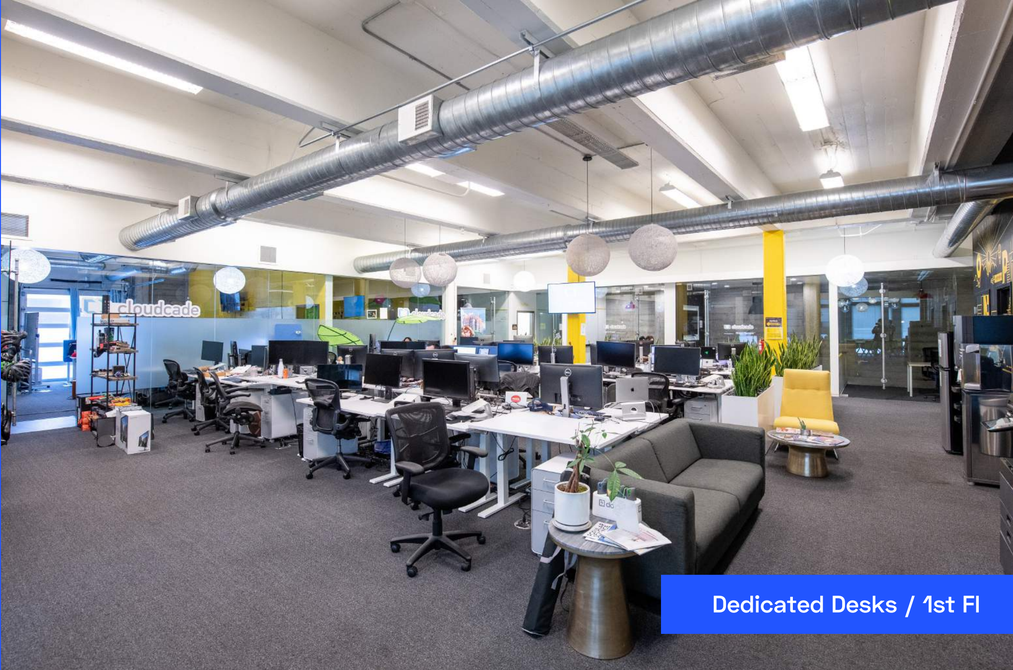
Dedicated Desks / 1st Fl