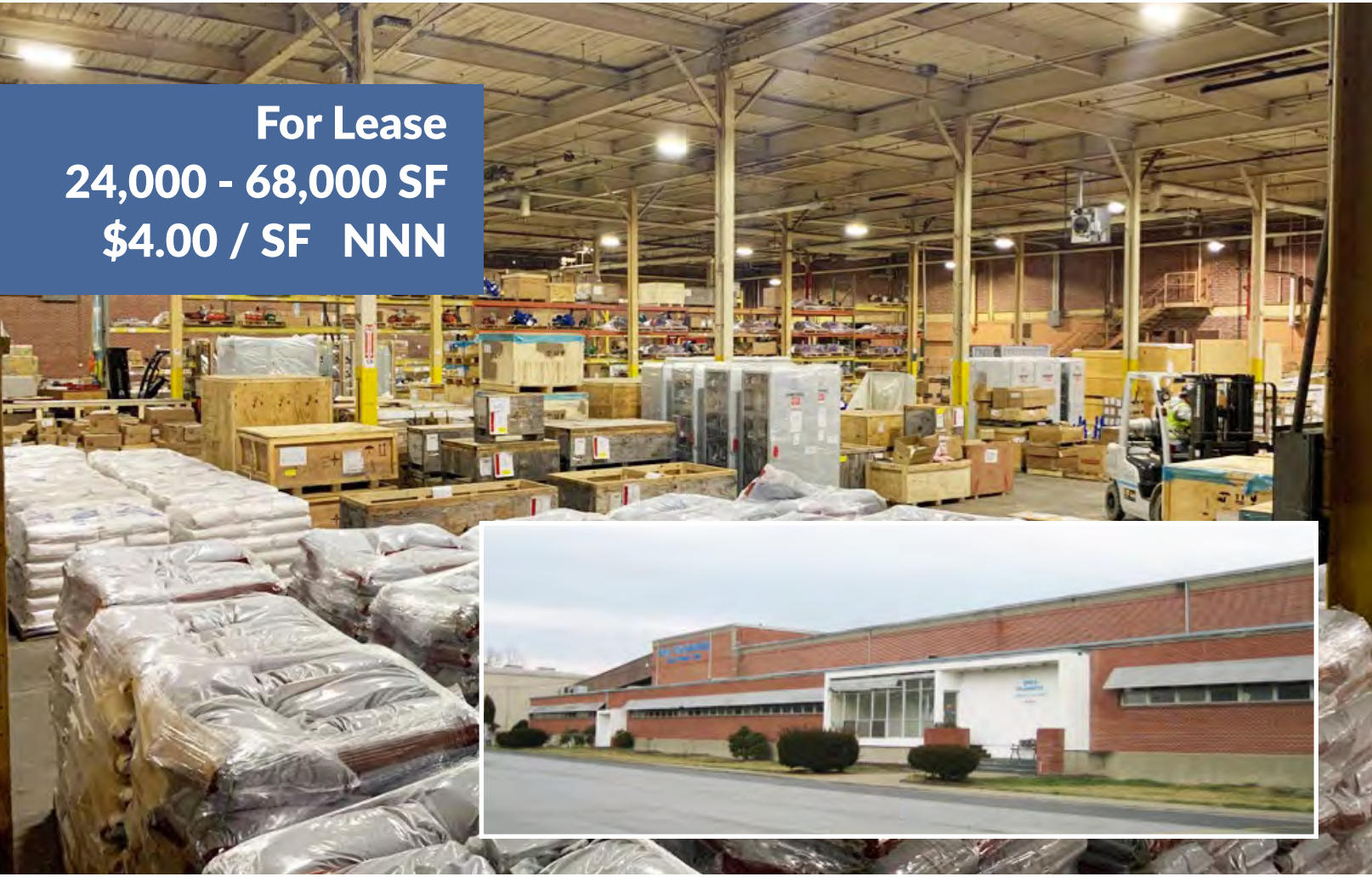
Interior view of a portion of the warehouse space; Insets: Exterior - four dock-high doors; Exterior - front of main facility

4600 Hendersonville Road, Fletcher, NC 28732