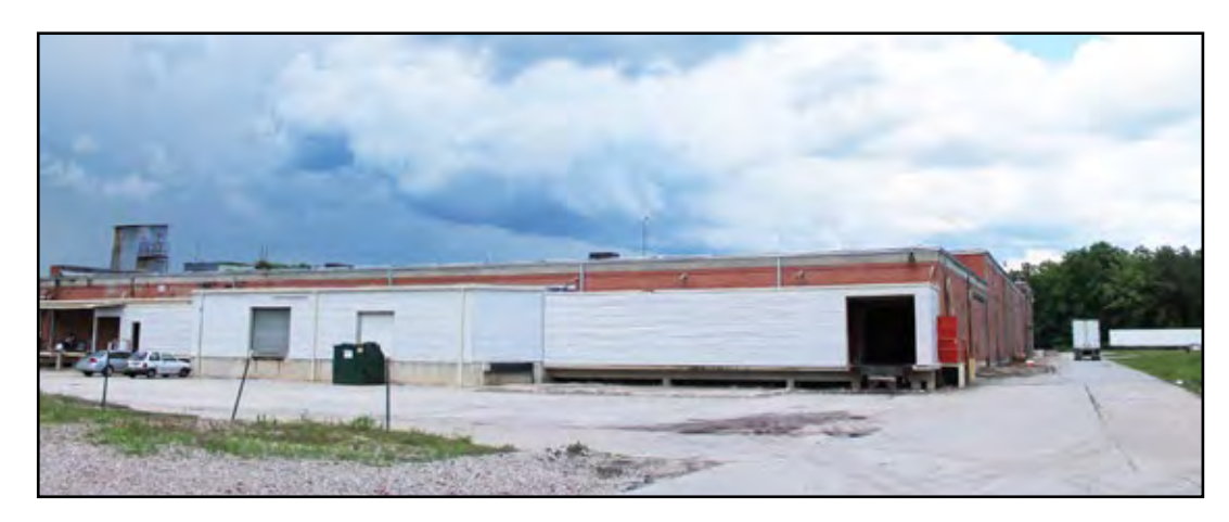
Main Building - Back side with dock-high doos and loading doors

4600 Hendersonville Road, Fletcher, NC 28732