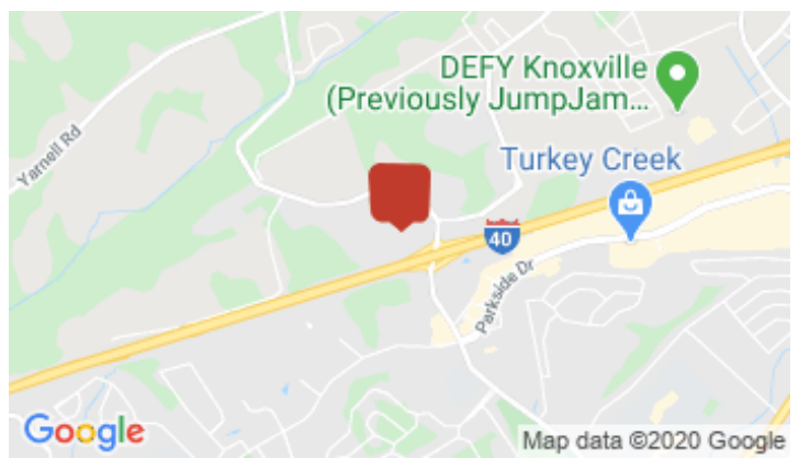
For Sale: 6.83 Acres