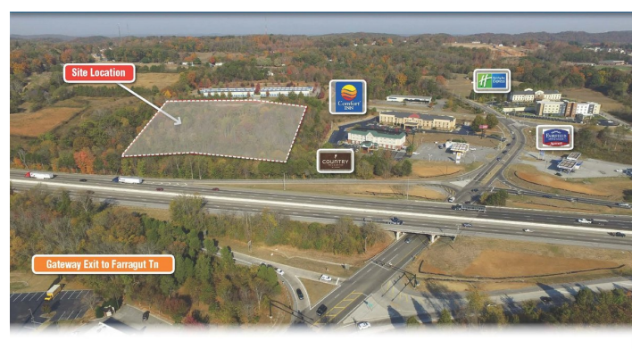
Campbell Station Road - Farragut, Tn