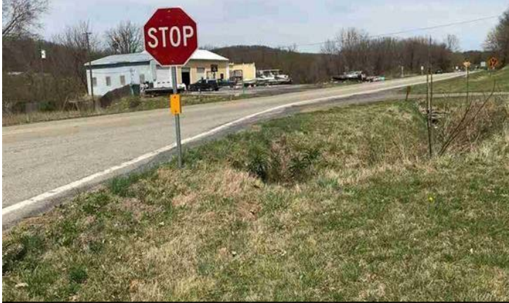
Northward Rt. 11