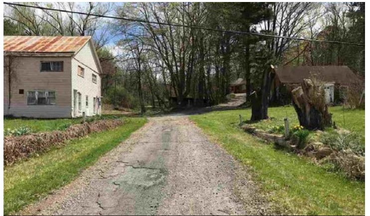
Barn & Building on Property