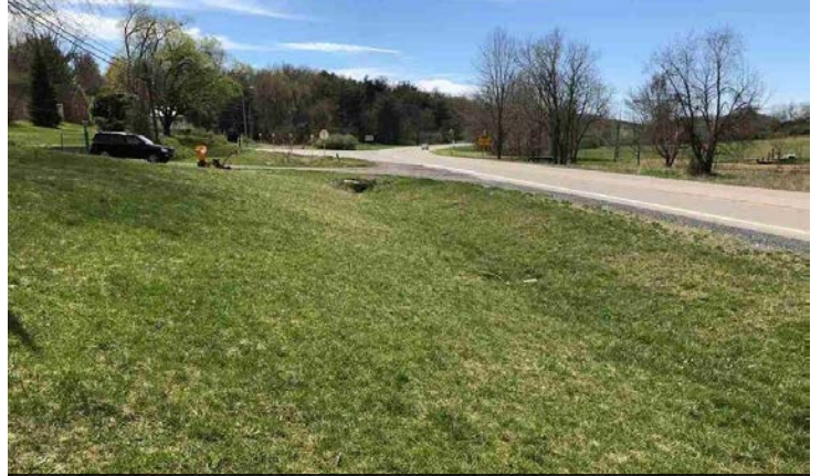
Southward Rt. 11