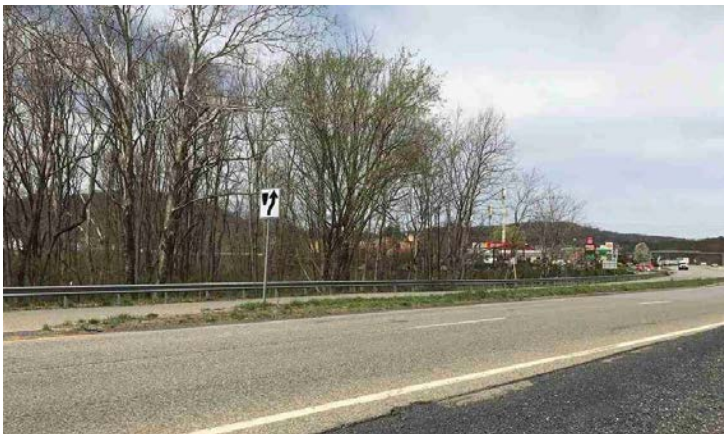
Pilot & New Love's Complex Across Rt. 11