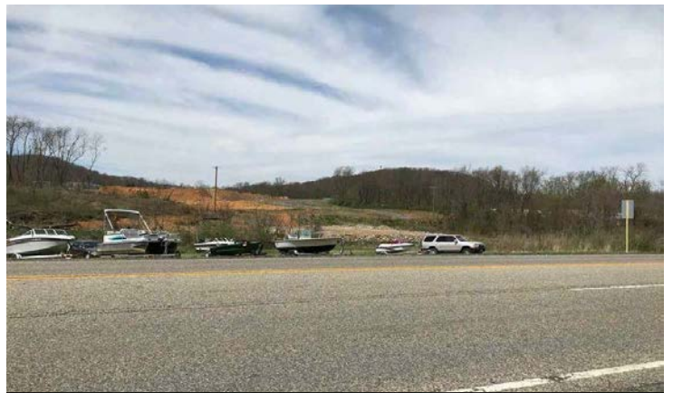
Love's Complex Under Construction