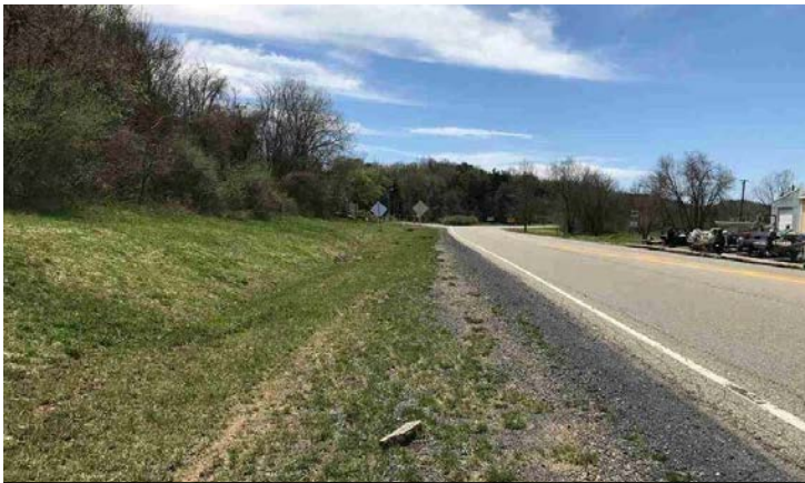
1400ft Road Frontage Along Rt. 11