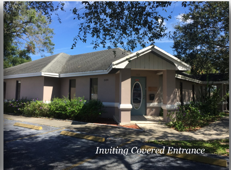
Inviting Covered Entrance