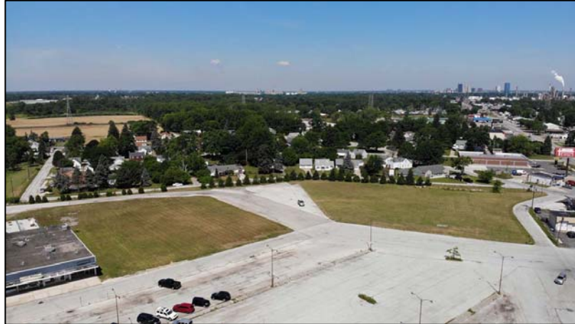
Buildout lots available