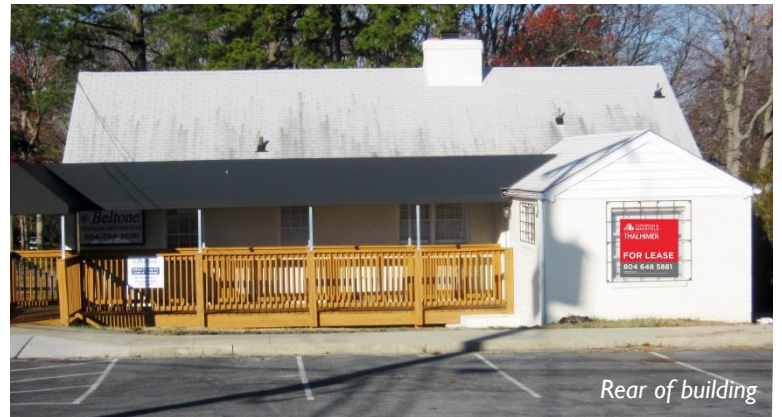
Rear of building