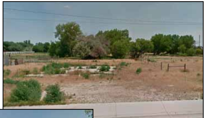
View from N. 11th Avenue.