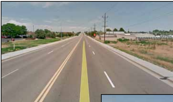
View of northbound N. 11th Avenue. The subject property is on the right.