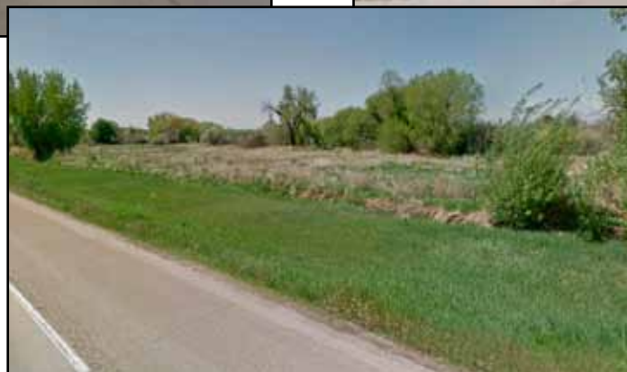
View from N. 8th Avenue.