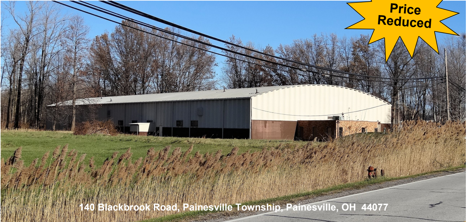
140 Blackbrook Road, Painesville Township, Painesville, OH 44077