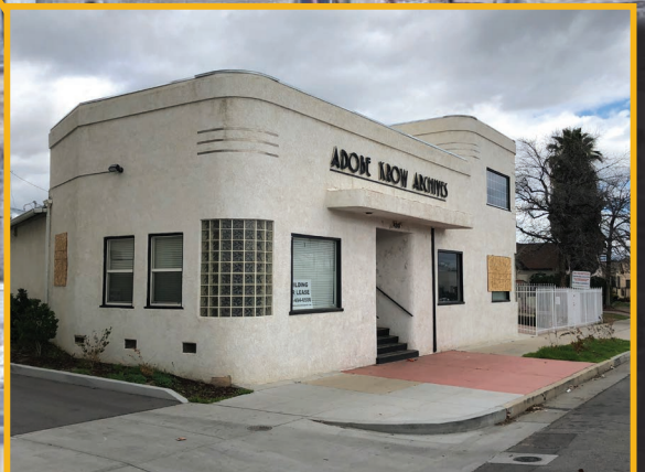
430 18th Street