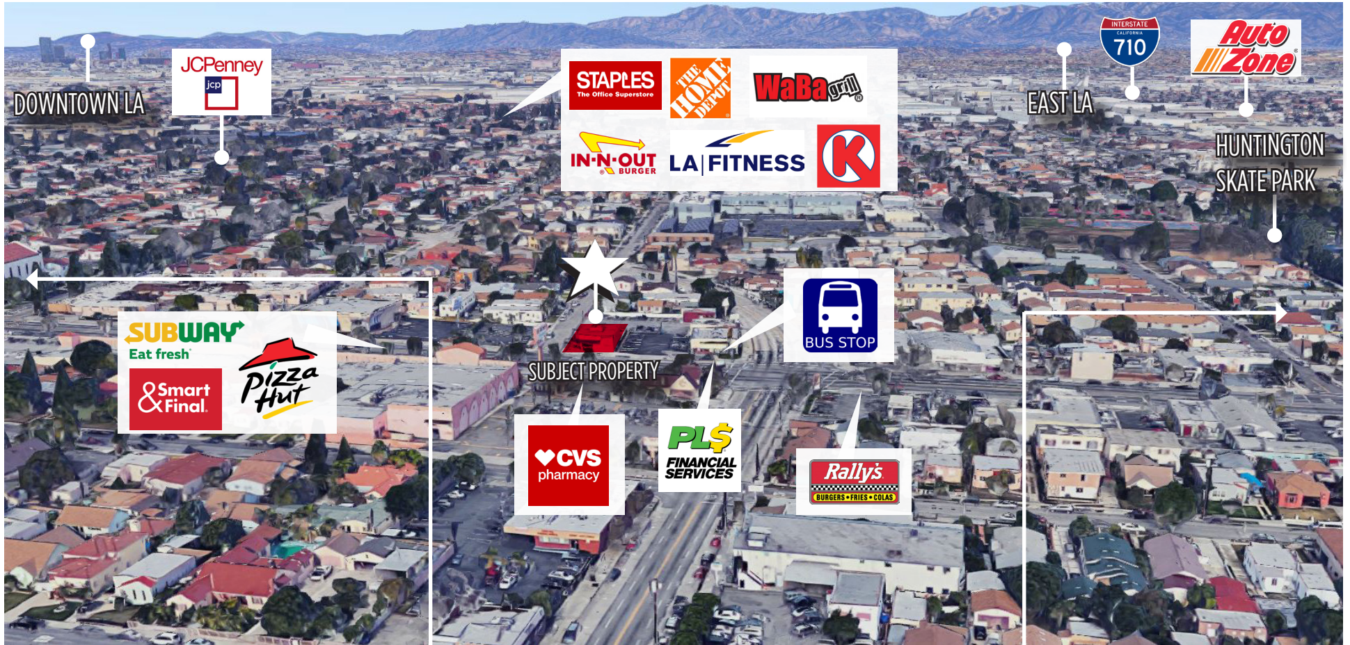
Less than 1 mile radius North