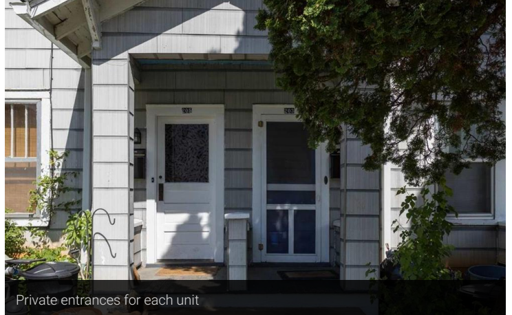
Private entrances for each unit