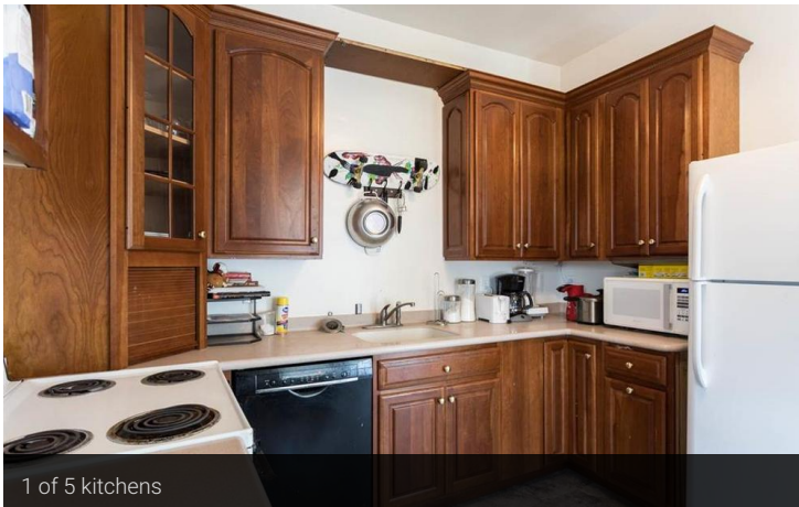
1 of 5 kitchens