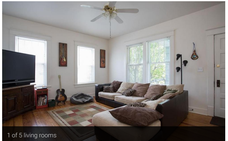
1 of 5 living rooms