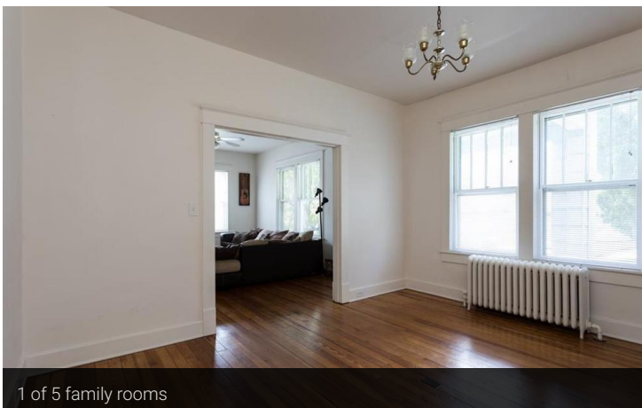
1 of 5 family rooms