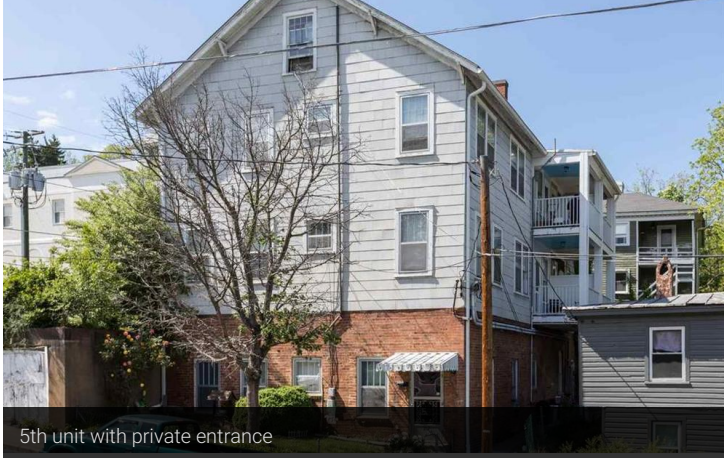
5th unit with private entrance