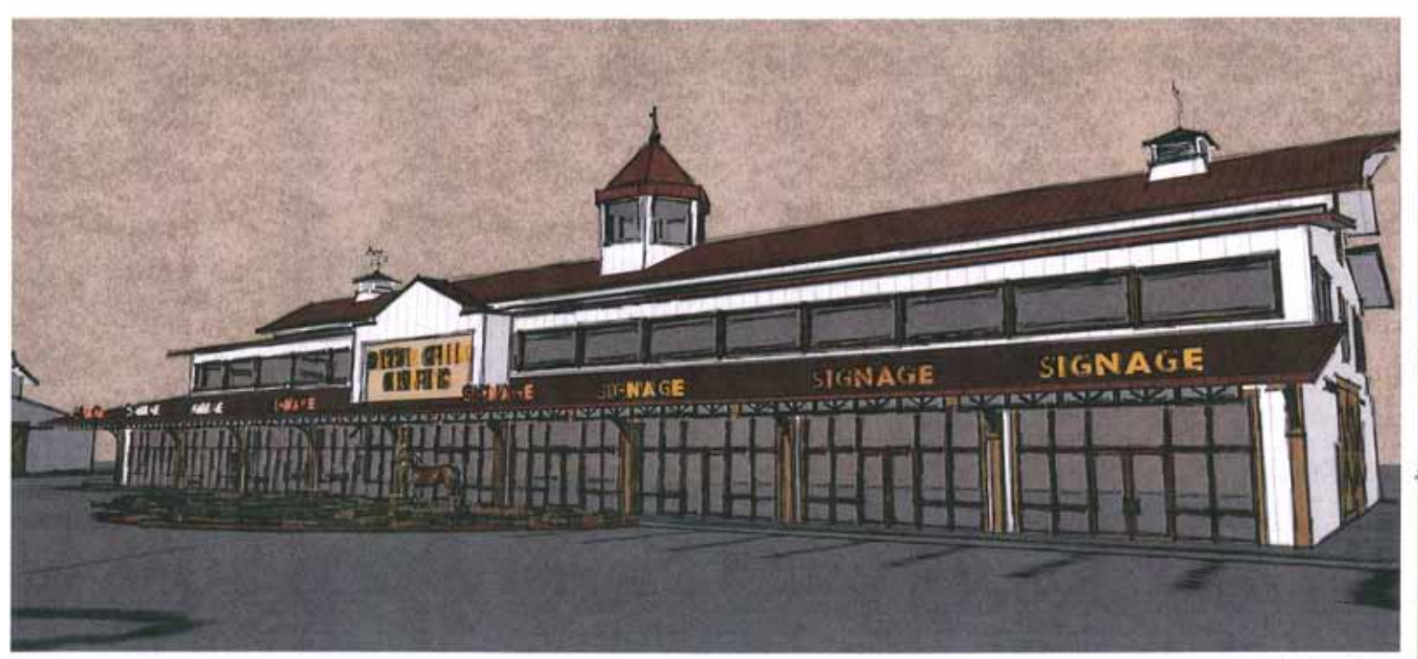
MWM Architects 2015