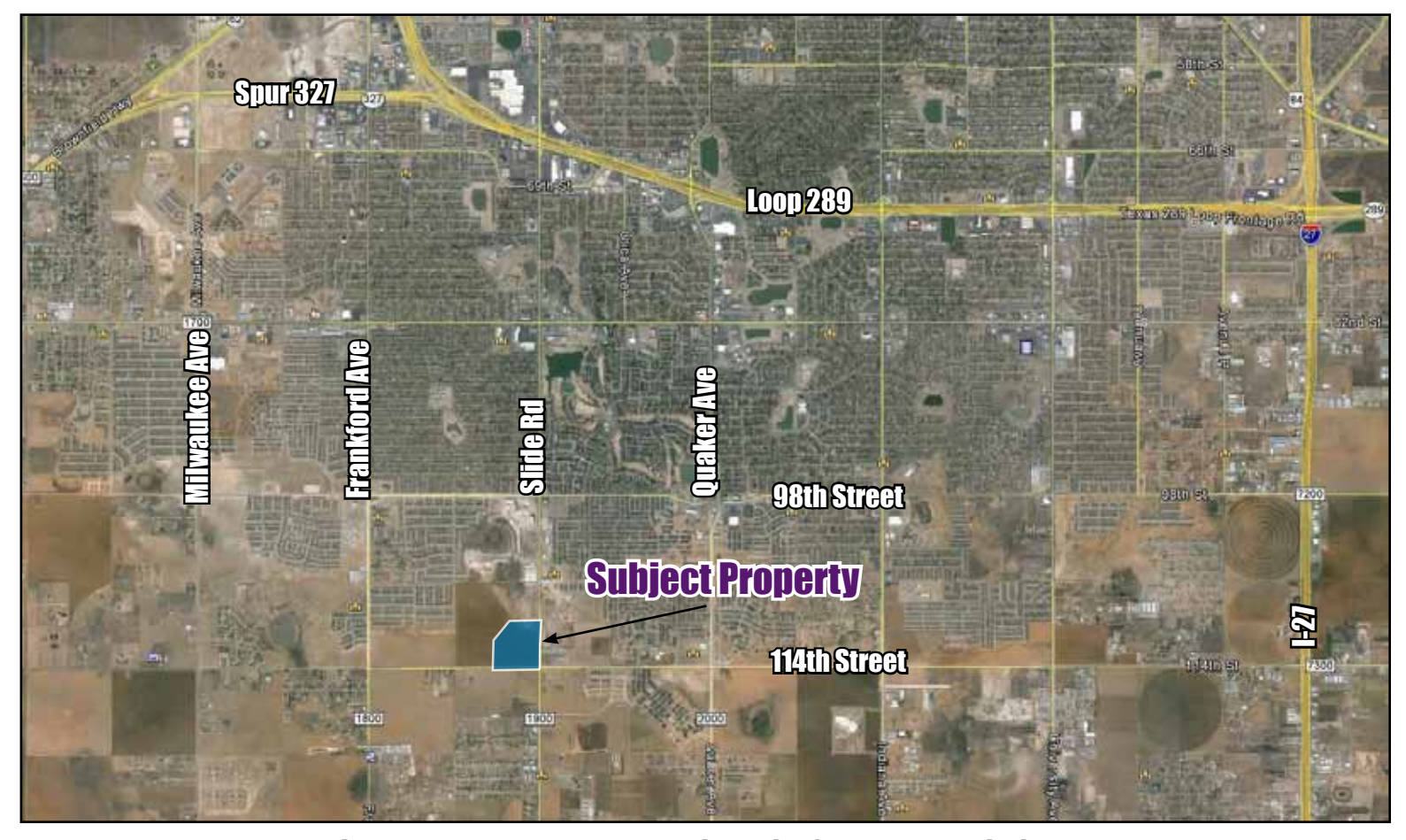
LARGER THAN AVERAGE C-3 HARD CORNER