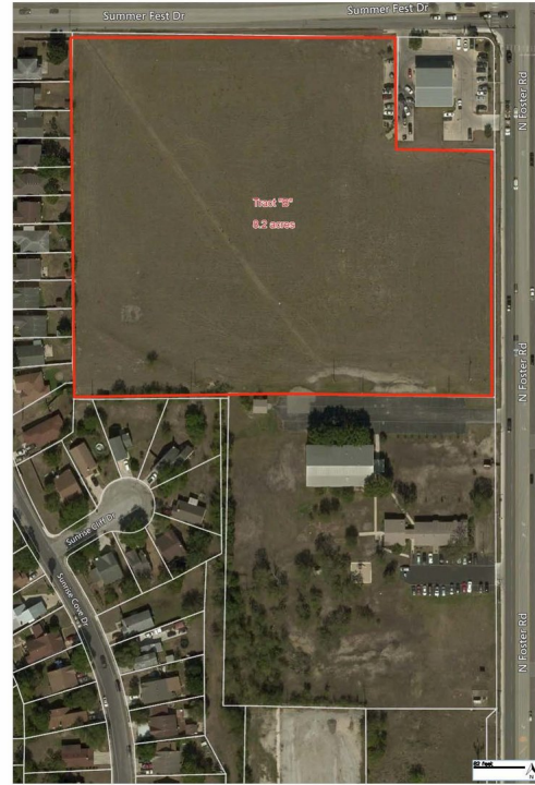
© 2018 Digital Map Products. All rights reserved.

Listing ID: 30330928 Status: Active Property Type: Vacant Land For Sale Possible Uses: Office, Retail Gross Land Area: 8.20 Acres Sale Price: $1,071,576 Unit Price: $130,680 Per Acre Sale Terms: Cash to Seller Nearest MSA: San Antonio-New Braunfels County: Bexar Tax ID/APN: 623273 Zoning: C-2 Property Visibility: Excellent