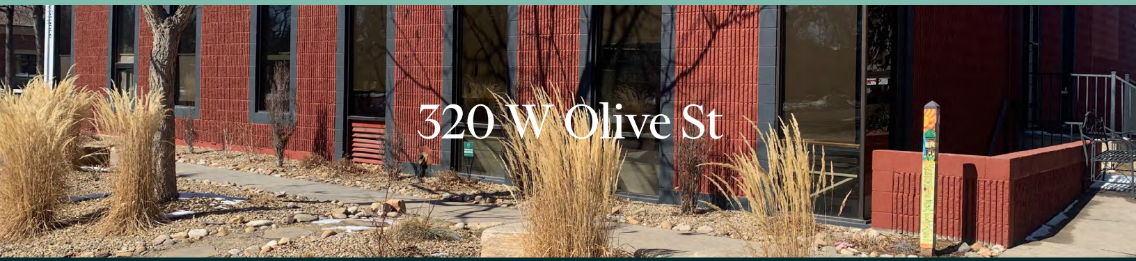
320 W Olive St

Contact Brokers for a Full Offering Memorandum of the Properties