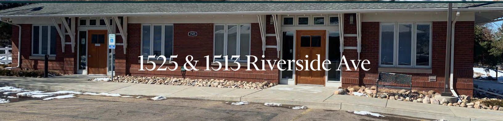
1525 & 1513 Riverside Ave