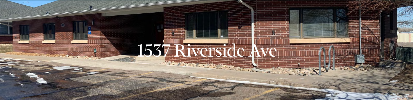
1537 Riverside Ave