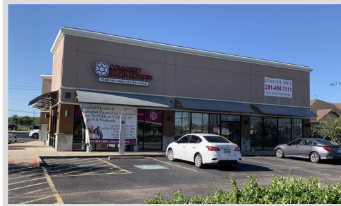
Side View One