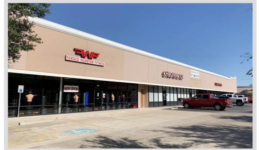
Side View Two