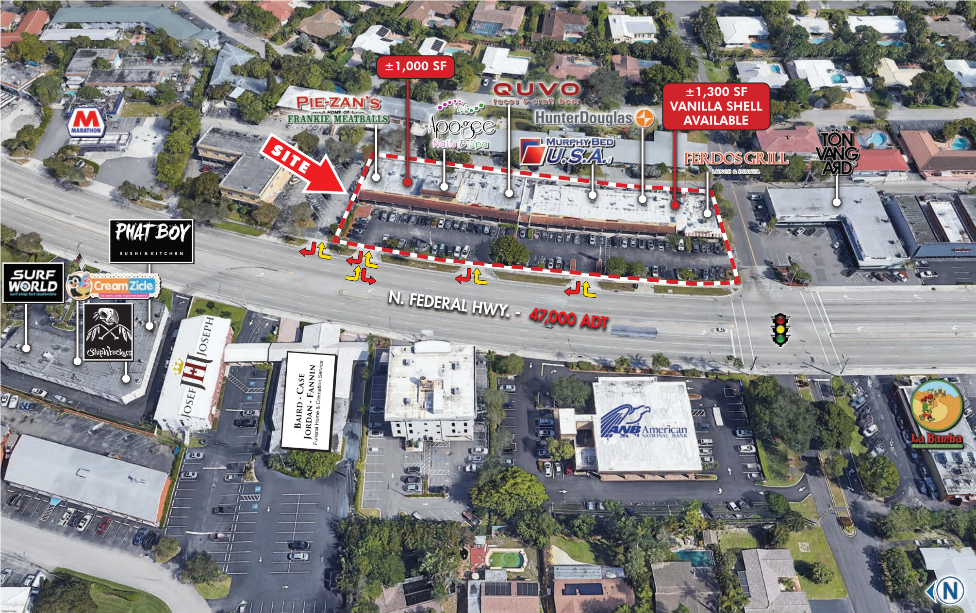
AERIAL | CLOSE-UP

4300 N. FEDERAL HIGHWAY FT. LAUDERDALE, FL