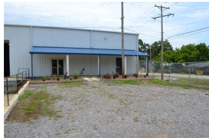
Large parking area