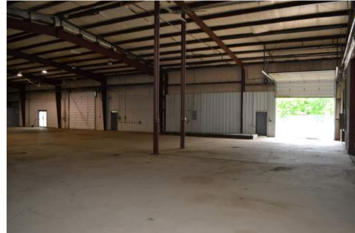
Two 14 ft. automatic doors