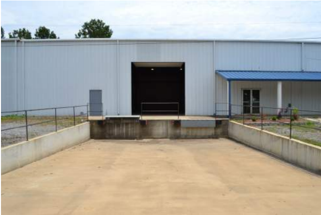
Side by Side truck wells w/ dock plates