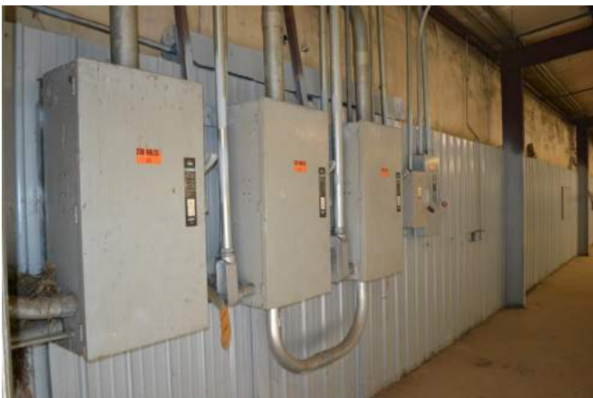
3 phase power