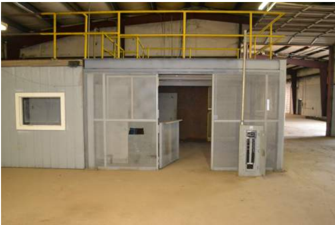
Secure parts room