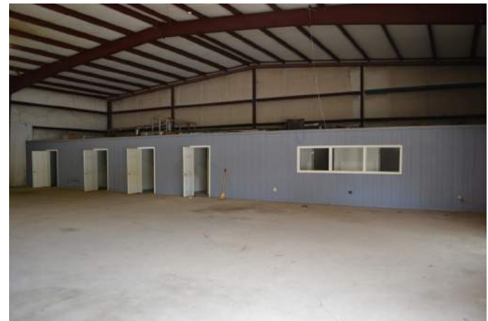
Access to office and restrooms from warehouse