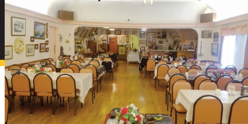
Second Floor Banquet Hall